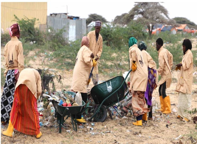
Environmental cleaning through cash for work in Mogadishu IDP camps