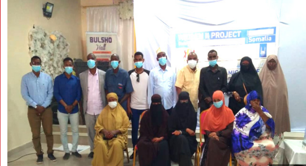
GAP training in Badhan district, Puntland - Somalia

Islamic Relief wishes to thank the following donors and partners for their generous contribution and technical support