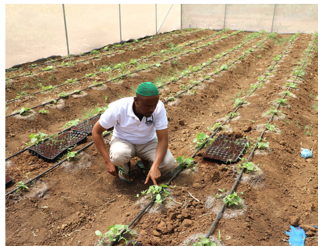
Inspection of seed plants and seedlings in Afgooye