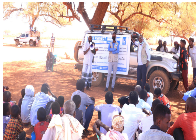
Launch of DRIFT project in Togdher region, Somaliland