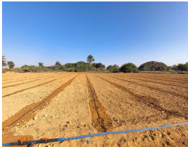
Support of drip irrigation system to Puntland farmers