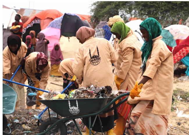
Environmental cleaning through cash for work in Mogadishu IDP camps