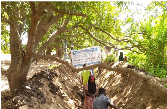
Islamic Relief's irrigation canals rehabilitation in Jowhar, Somalia