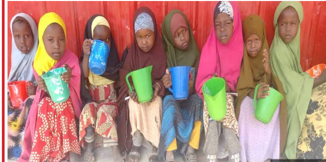
Feeding support to the internally displaced school children in Beledweyne, Hiran region - Somalia