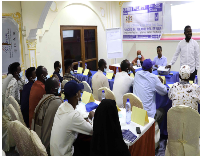
Dry land agriculture and post harvest training to Puntland farmers