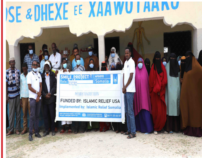
Community farmers completed post harvest management training in Afgooye