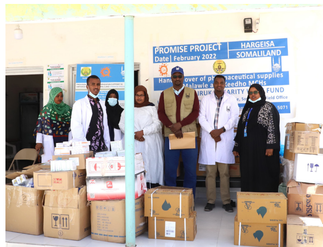
Handover ceremony of medicines and health items to Malawle & Xeedho MCHs Somaliland