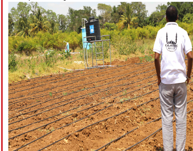
Drip irrigation layout on open farms in Afgooye