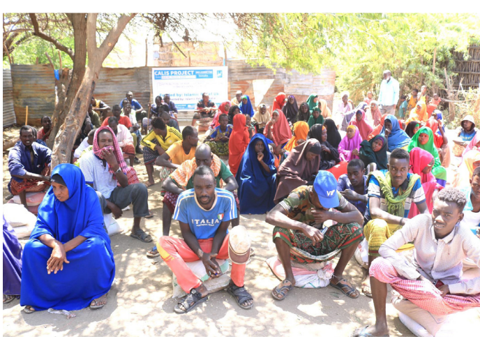
Agricultural seeds distribution to Beledweyne farmers