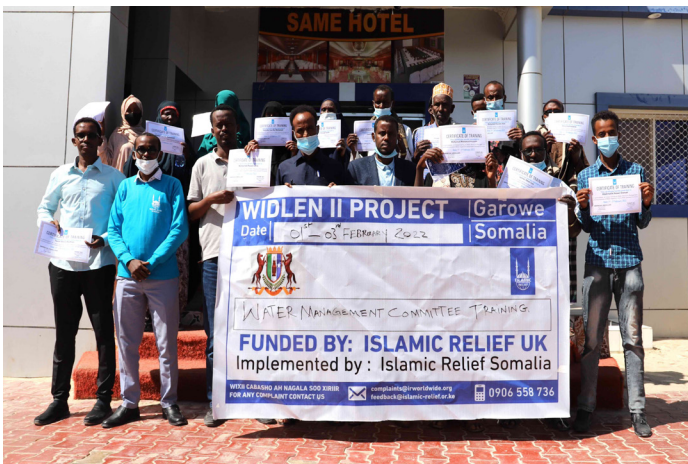
Water management committee training in Garowe, Puntland