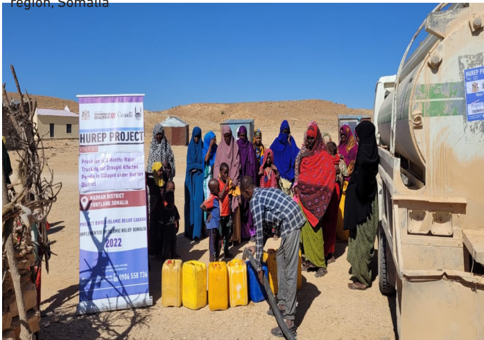
Water trucking to the drought affected in HHs in villages under Badhan district Puntland, Somalia