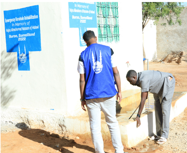
Emergency borehole rehabilitation in Burao, Somaliland