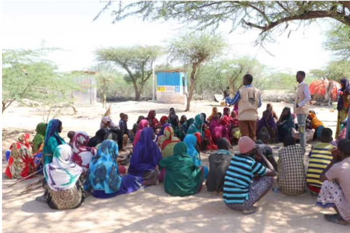
Protection awareness in Raar-dawo and Eyle IDP camps in Berdale Bay region, Somalia