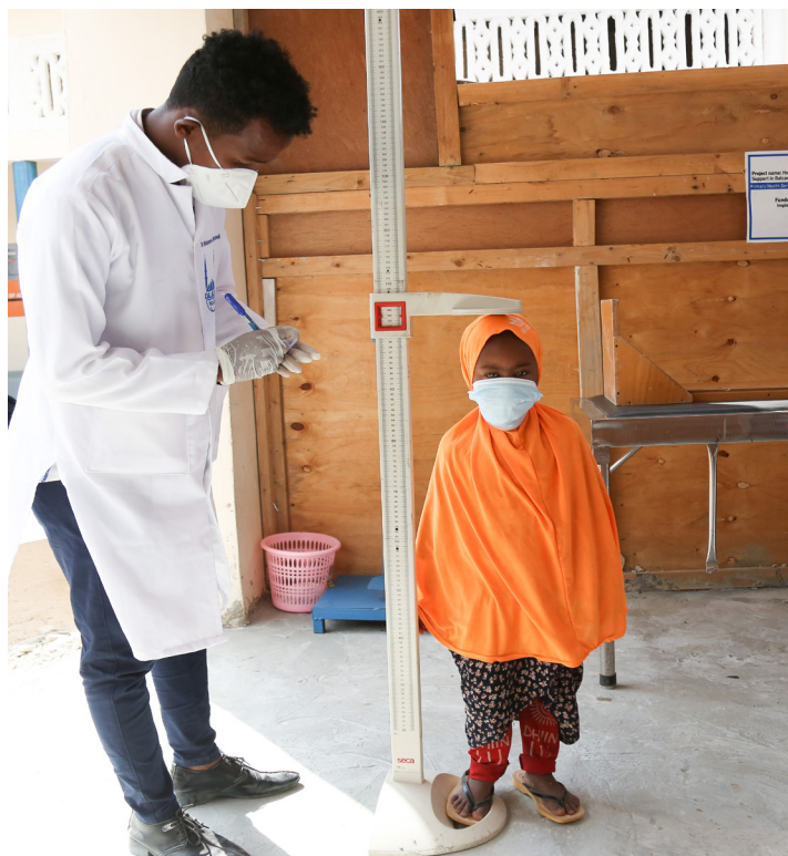
Provision of health support to the vulnerable patients in Mogadishu, Somalia