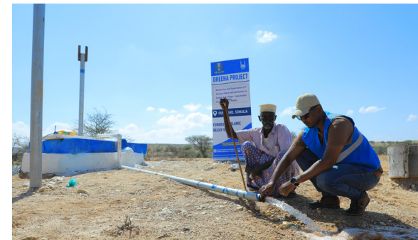
IR Somalia rehabilitated shallow wells in Gabigadud village of Puntland, Somalia