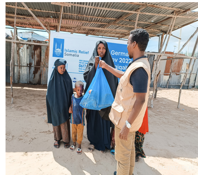
Provision of Aqiiqah & Adak meat packs to the drought affected families in Daynile IDP camps of Mogadishu, Somalia.