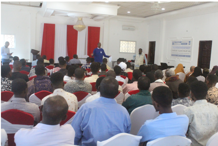
Community mobilization, selection and verification of Waheen market fire in Hargeisa