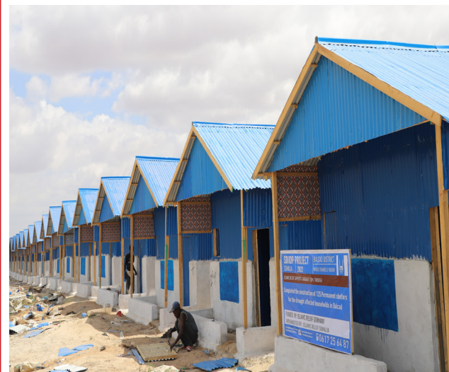
Construction of 125 permanent shelters to the drought affected families in Balcad IDP Camps, Middle Shabelle region.