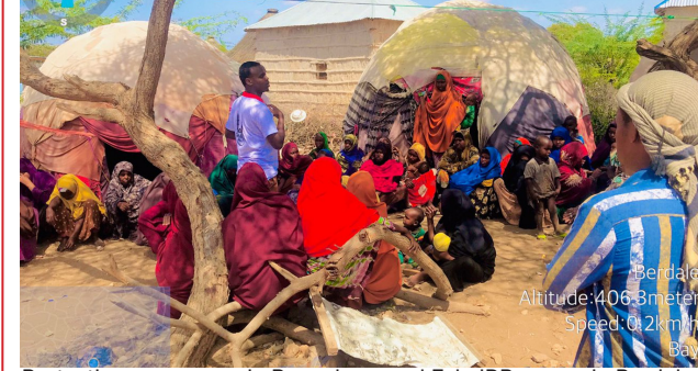
Protection awareness in Raar-dawo and Eyle IDP camps in Berdale Bay region, Somalia

I am always in charge of coordinating, engaging government line ministries, monitoring and evaluating ongoing WaSH-related activities in the field. Preparing technical WaSH reports, approving completion certificates, and assisting program staff with other program activities are also part of tasks.