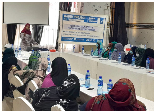
Strees and Psychosocial support training to the orphan families in Hargeisa, Somaliland