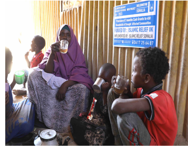
Provision of 3 months cash grants to the drought affected families in Beledweyne, Somalia.