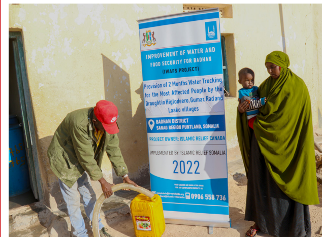
Water trucking to the drought affected in HHs in Gumar, Laako and Rad villages of Badhan district Puntland, Somalia