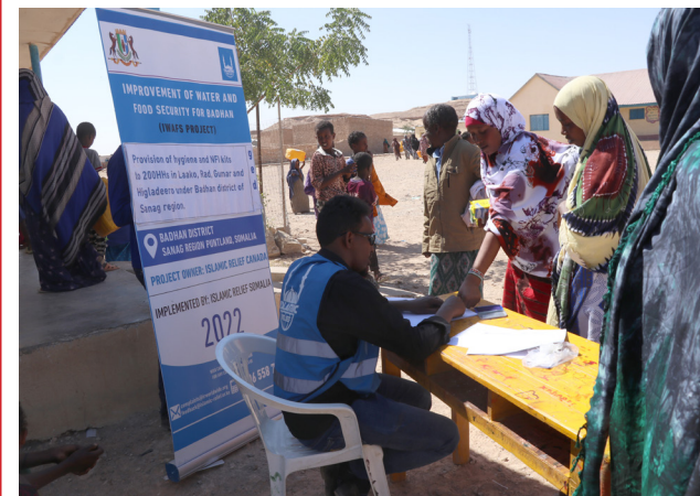
Distribution of NFIs and hygiene kits to the drought affected HHs in Laako and Rad villages in Badhan district of puntland, Somalia