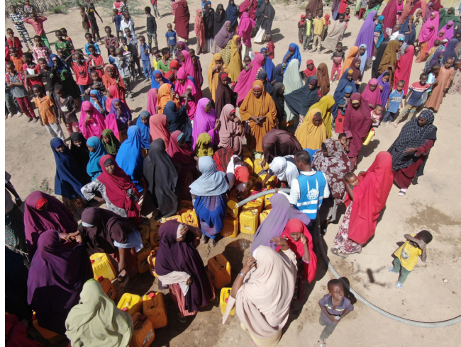
Water trucking to the drought affected in HHs in Beledweyne Somalia