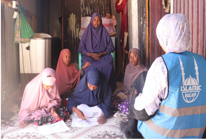
Orphan's home visit and assessment in Hargeisa, Somaliland.