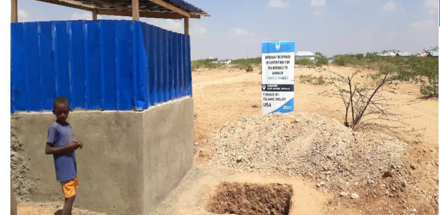
Construction of latrines to the drought families in Bardhere district of Gedo region, Somalia