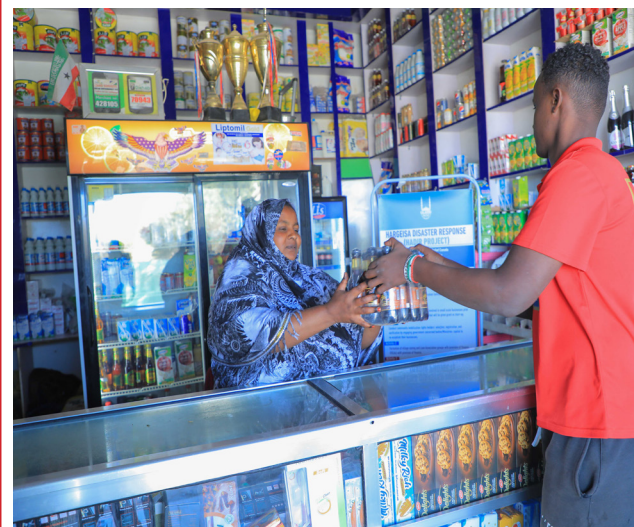
Islamic Relief's support to Waheen fire business families in Hargeisa