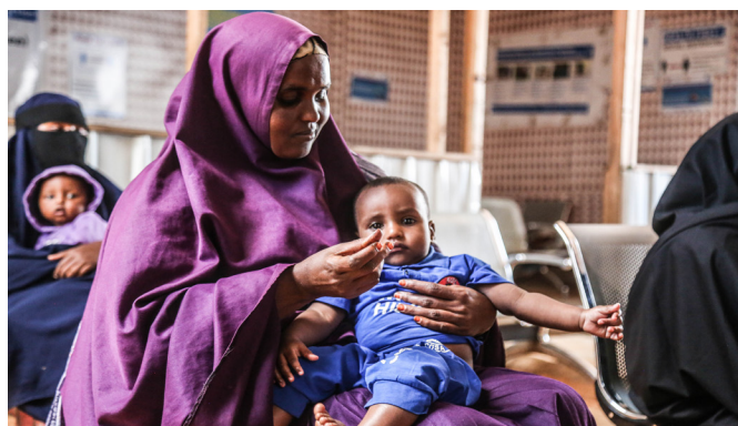
Provision of health support to the vulnerable patients in Mogadishu