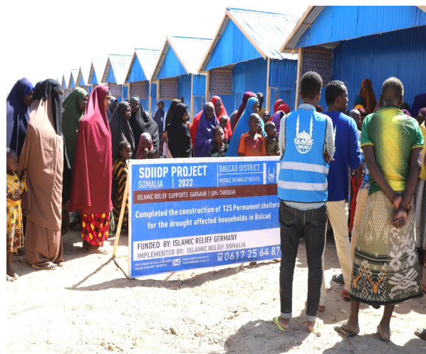
Handing over of 125 permanent shelters to the drought affected families in Balcad IDP Camps, Middle Shabelle region of Somalia