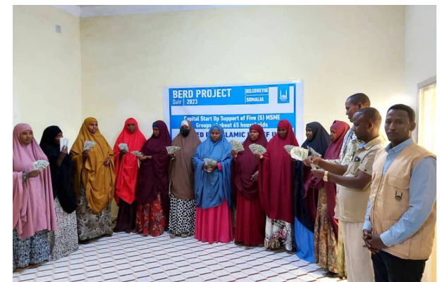
Financial assistance to 65 self help groups in Beledweyne, Somalia