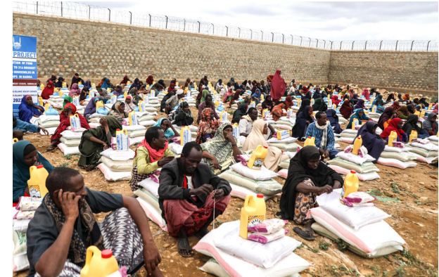
Provision food packages to the drought affected families in Baidoa.