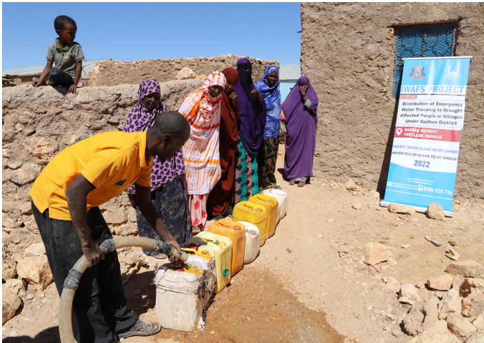
Water trucking to the drought affected in HHS in villages under Badhan district Puntland, Somalia