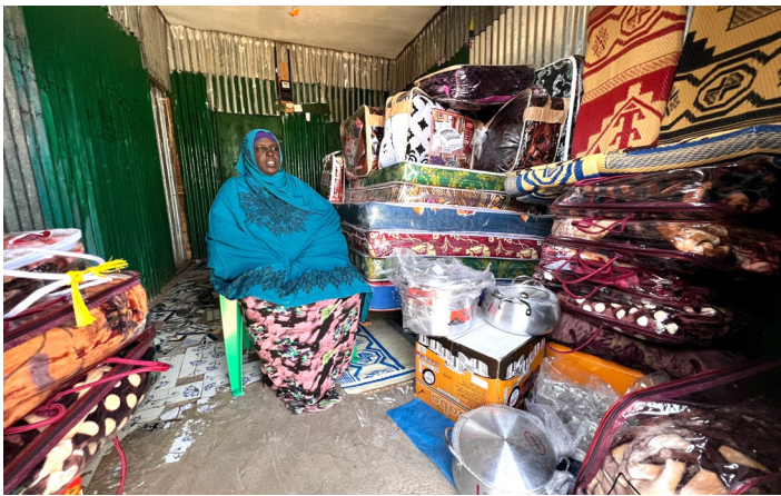
Islamic Relief's support to Waheen fire business families in Hargeisa