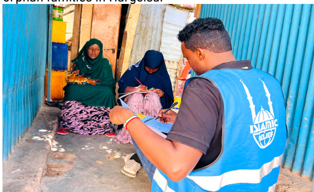
Orphan's home visit and assessment in Hargeisa, Somaliland.