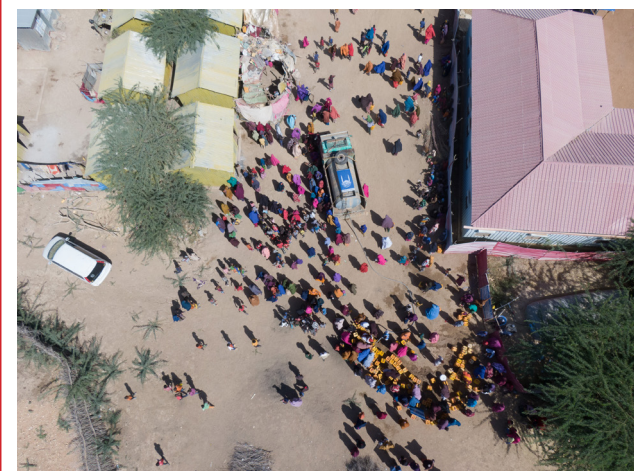
Water trucking activities to the drought affected families in Beledweyne district of Hiran region, Somalia