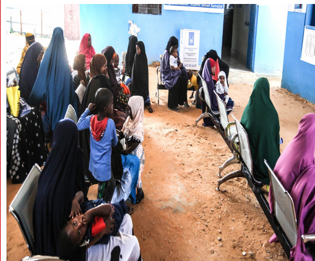
Provision of health support to the vulnerable patients in Mogadishu