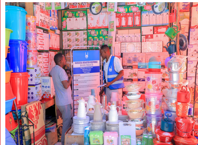
Islamic Relief's support to Waheen fire business families in Hargeisa