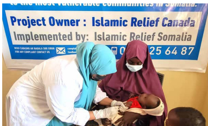
Provision of health support to the vulnerable children in Mogadishu