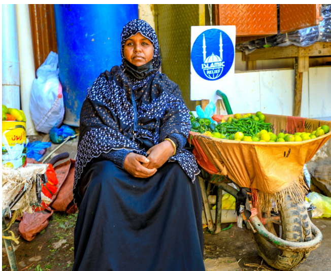
Islamic Relief's support to Waheen fire business families in Hargeisa