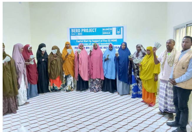
Financial assistance to 65 self help groups in Beledweyne, Somalia