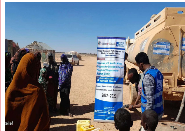
Water trucking activities to the drought affected families in villages under Badhan district of puntland, Somalia