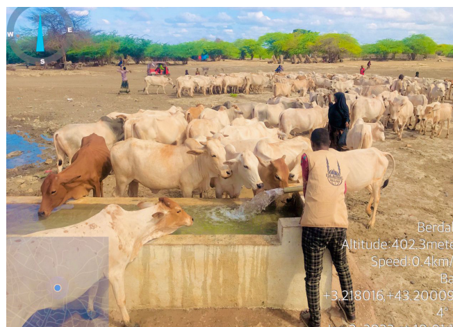
Rehabilitation of boreholes in Berdale district of Bay region, Somalia