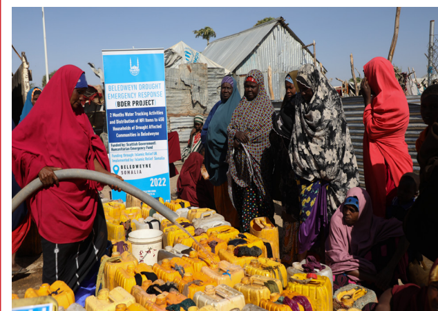
Water trucking activities to the drought affected families in Beledweyne district of Hiran region, Somalia