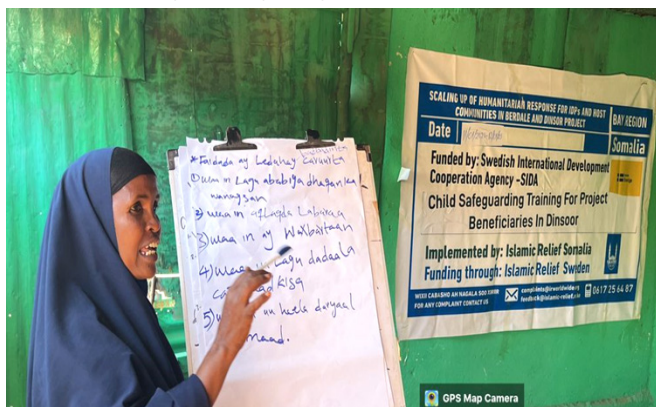
Training communities on child safeguarding and its importance in Dinsor district of Bay region, Somalia