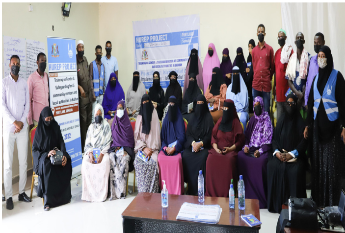
Training of 45 community members and local authority on GBV and safeguarding in Badhan Puntland, Somalia