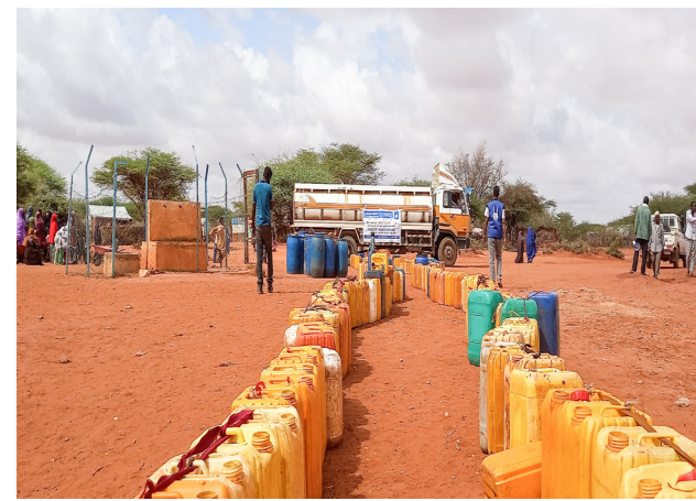
Water trucking activities to the drought affected HHs in Warcibran Somaliland