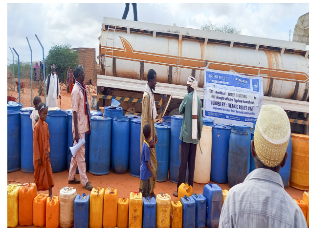
Water trucking activities to the drought affected HHs in Warcibran Somaliland