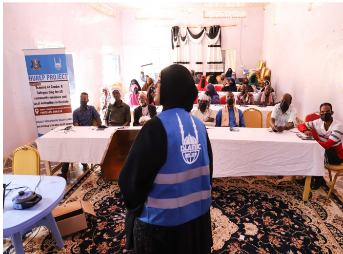
Training of 45 community members and local authority on GBV and safeguarding in Badhan Puntland, Somalia