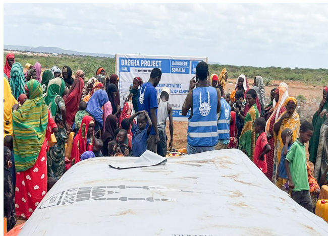
Water trucking activities to the drought affected HHs in Bardhere, Somalia