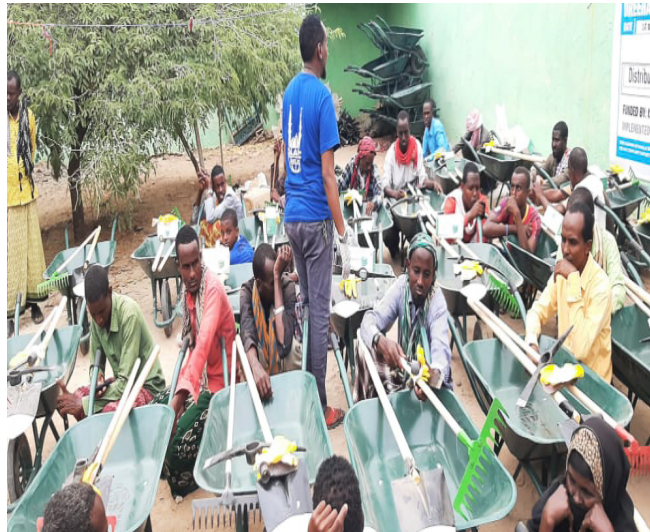
Distribution of cash for work tools to 230 drought affected HHs in Bardhere, Somalia