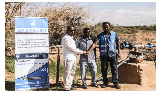
Handing over of a rehabilitated Borehole in Buraao, Somaliland