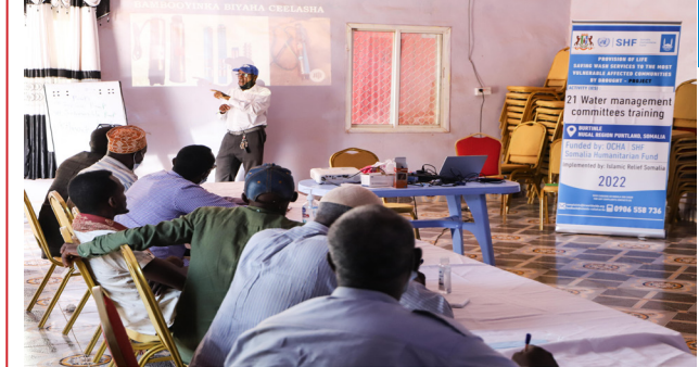
Training of water management committees in Burtinle Puntland, Somalia