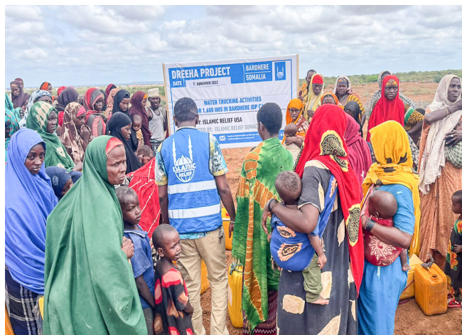
Water trucking activities to the drought affected HHs in Bardhere, Somalia