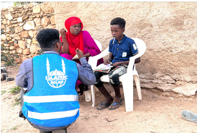
Orphans home visit and assessment in Somaliland