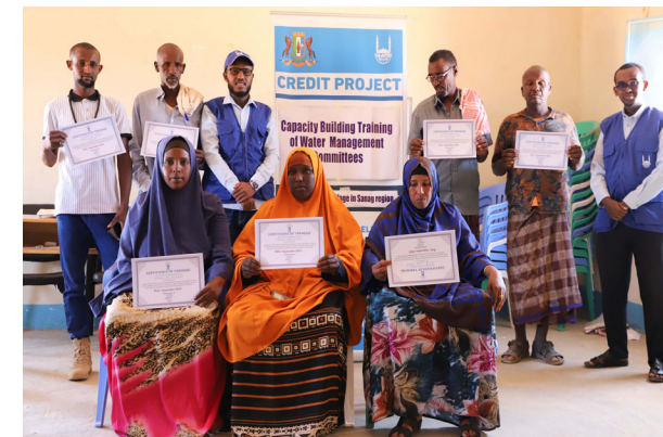
Training of water management committees in Puntland, Somalia