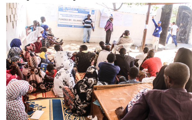
Training on community business development and income promotion in Somaliland