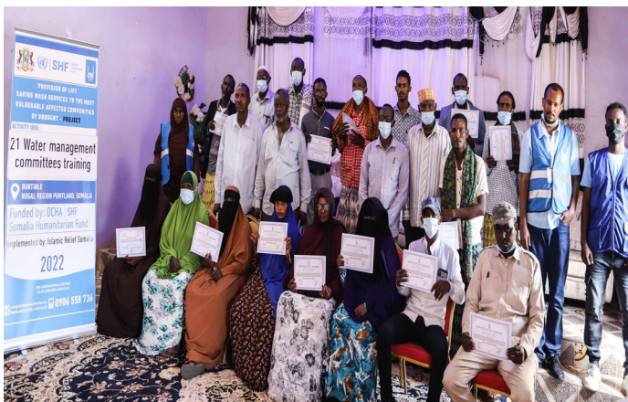
Training of water management committees in Burtinle Puntland, Somalia