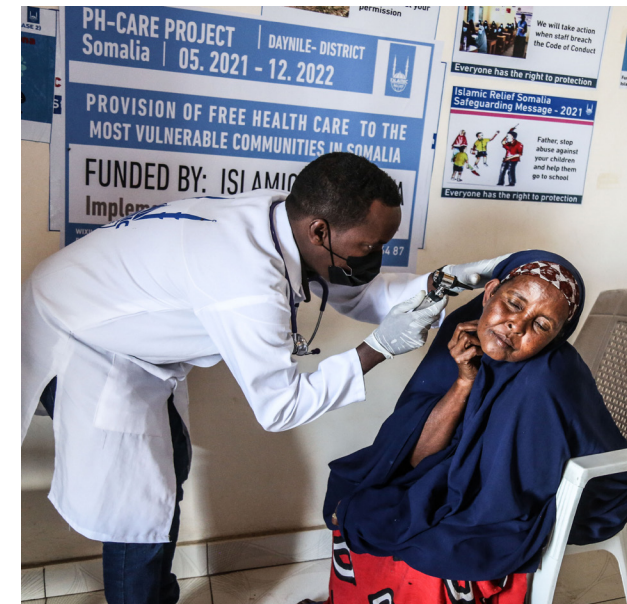
Provision of health support to the vulnerable patients in Mogadishu