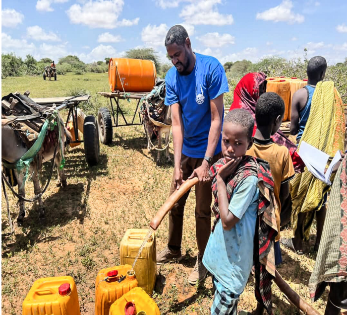
Water trucking activities to the drought affected HHs in Balcad, Somalia