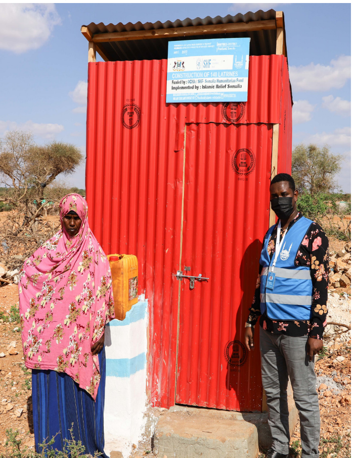
Construction of latrines to the drought affected HHs in Burtinle, puntland