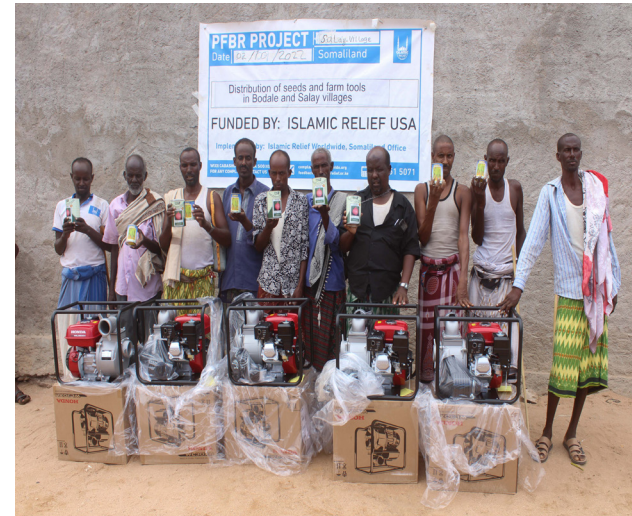
Distribution of seeds and farm tools to Salay and Bodale villagers in Somaliland