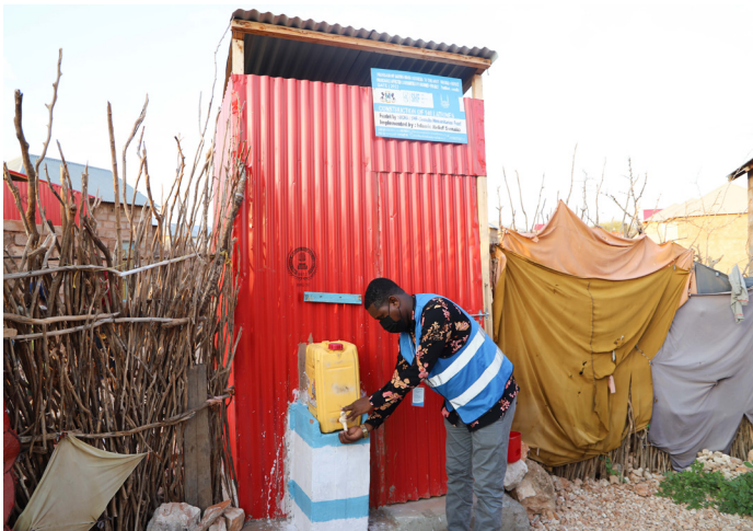
Construction of latrines to the drought affected HHs in Burtinle, puntland