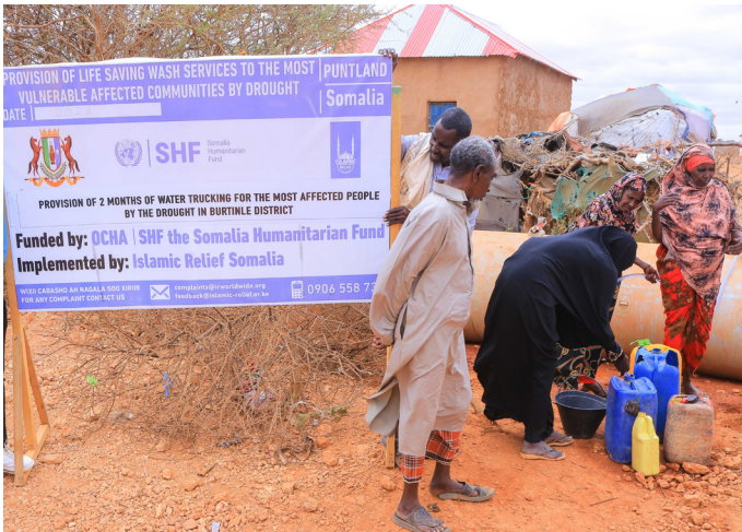
Provision of clean and safe water to drought affected families in Burtinle district of Puntland, Somalia