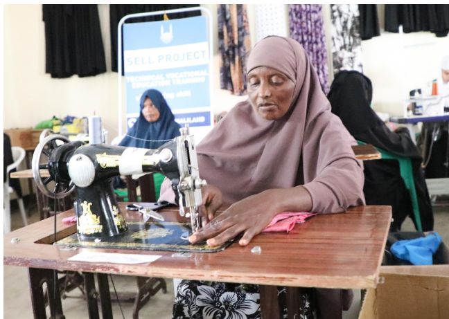
Distribution of high quality electric sewing machines to over 15 members of widowed mothers in Borama, Somaliland