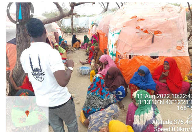
Training on child protection and GBV awareness in Berdale, Bay region , Somalia

11 Aug 2022 10:22:47 3°13'10"N 43°12'28"E 168° S Altitude:376.4m Speed:0.0km/h