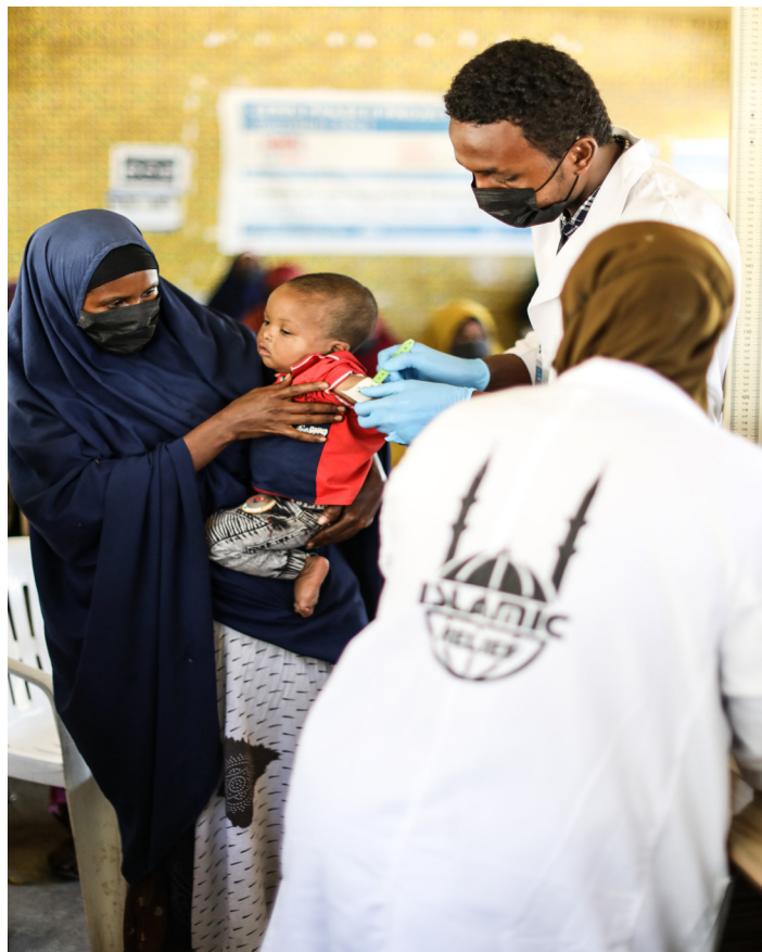
Provision of health support to the vulnerable patients in Mogadishu, Somalia