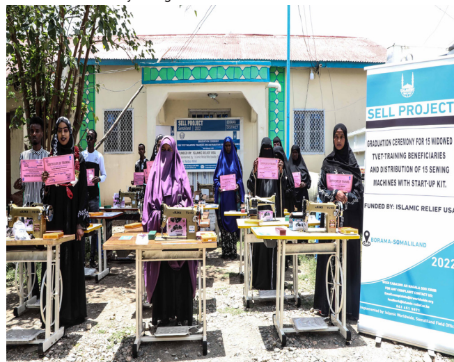
Distribution of high quality electric sewing machines to over 15 members of widowed mothers in Borama, Somaliland