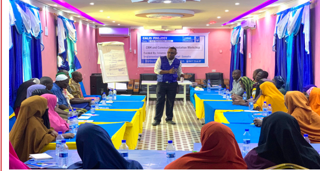
CRM and community orientation workshop in Jowhar, Somalia