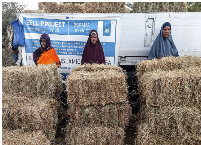
Distribution of livestock fodder to 17 rightholders in Borama, Somaliland