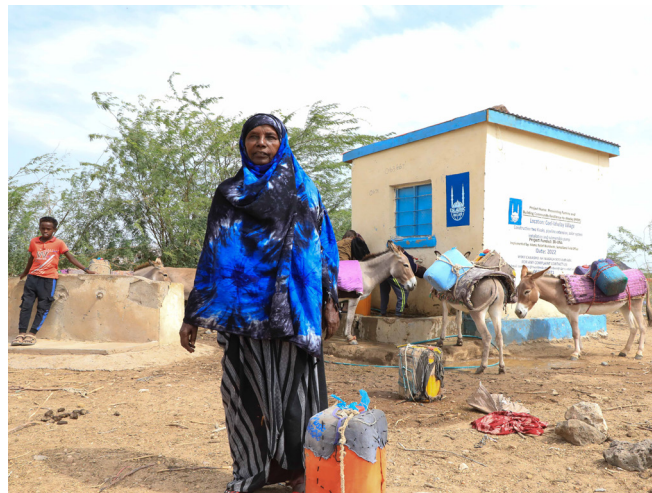
Construction of a kiosk, water tank, pipeline extension and solar installaion of Sallay village in Somaliland