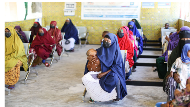
Provision of health support to the vulnerable patients in Mogadishu, Somalia