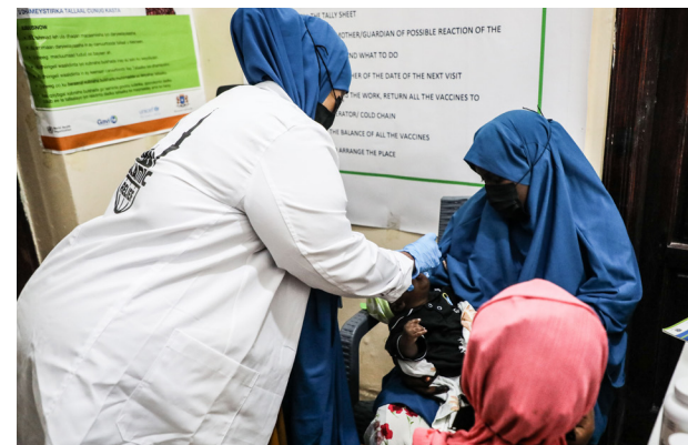
Provision of health support to the vulnerable patients in Mogadishu, Somalia