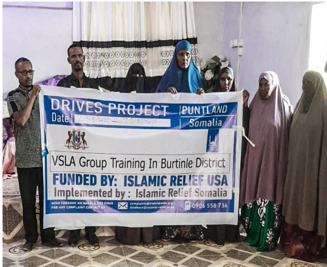
VSLA Group training in Burtinle district of Puntland, Somalia