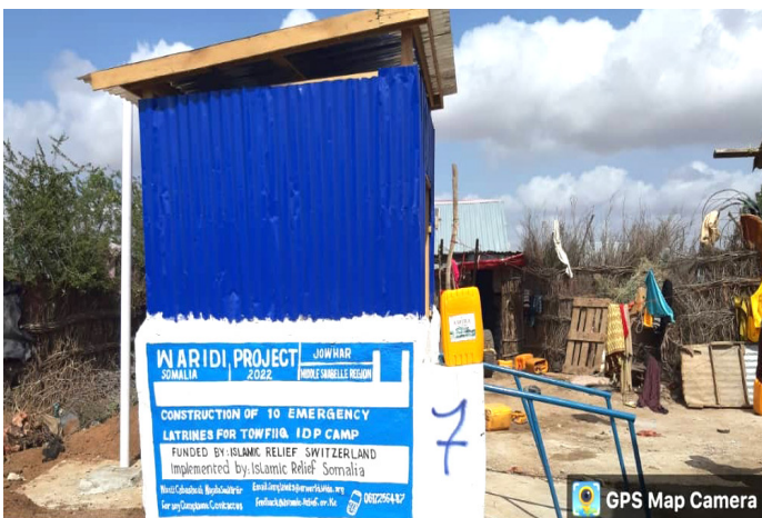
Construction of 10 emergency latrines for Towfiq IDP cam in Jowhar, Somalia