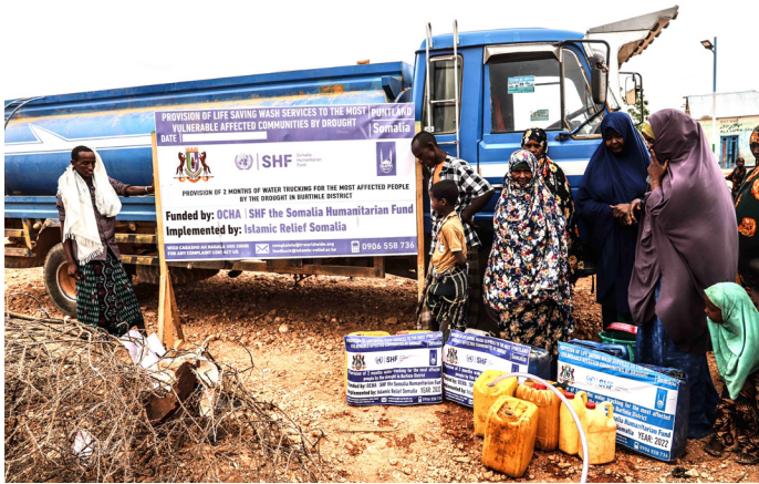
Provision of clean and safe water to drought affected families in Burtinle district of Puntland, Somalia