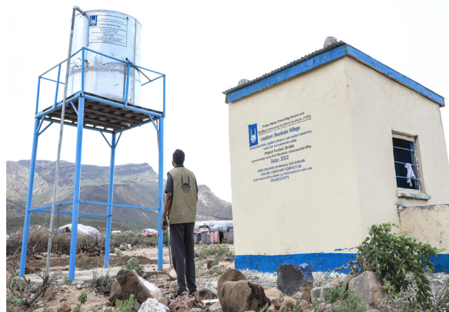
Construction of a kiosk, water tank, pipeline extension and solar installaion of Sallay village in Somaliland