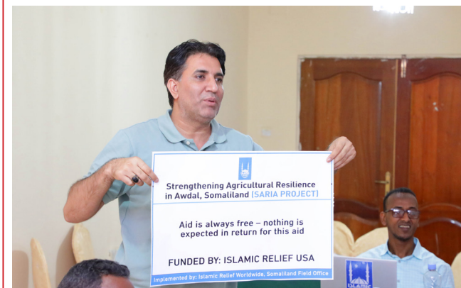
Staff training on safeguarding and PSEAH in Hargeisa, Somaliland