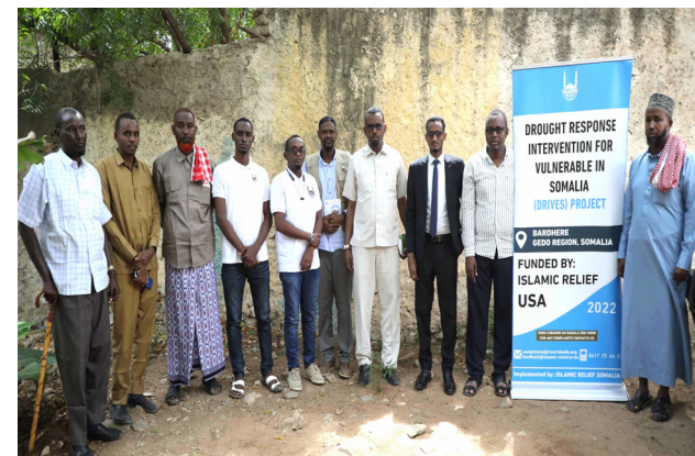
Launching of Drought Response Project in Bardhere, Gedo-Somalia