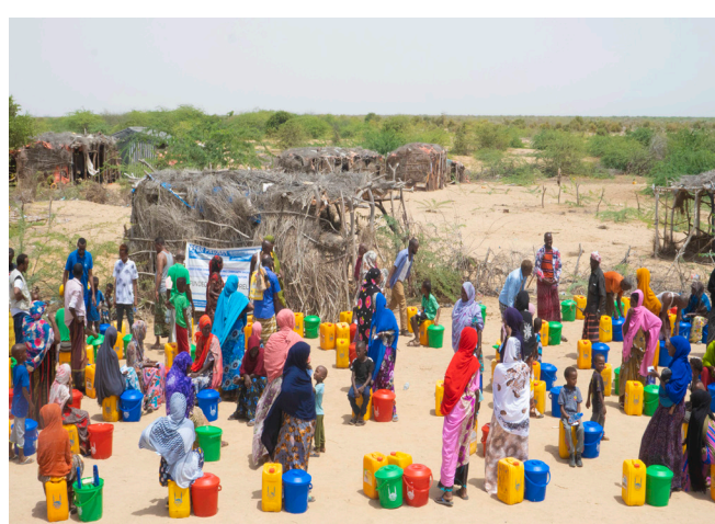
Distribution of hygiene kits to 250HHs in Bulahar district of Somaliland