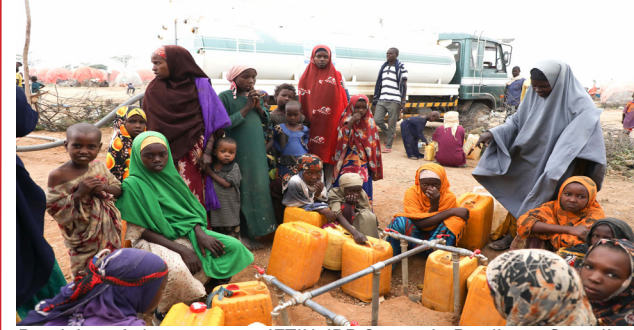
Provision of clean water to IFTIN IDP Camps in Bardhere, Somalia