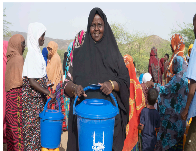
Distribution of hygiene kits to 250HHs in Bulahar district of Somaliland