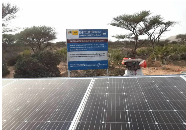
Deepening of shallow wells and installation of solar systems in Gabigadud village, Puntland-Somalia