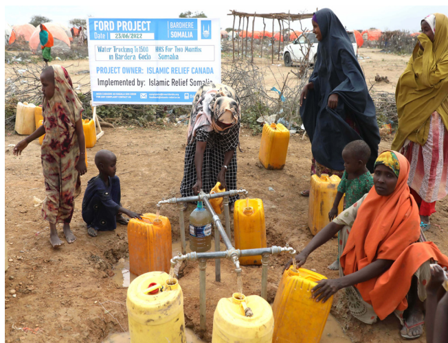
Provision of clean water to IFTIN IDP Camps in Bardhere, Somalia