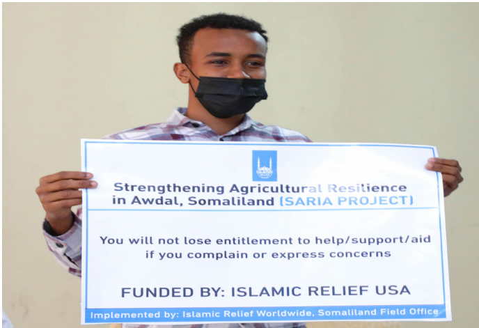
Staff training on safeguarding and PSEAH in Hargeisa, Somaliland