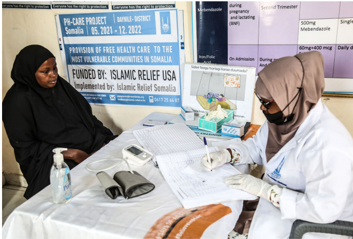
Provision of health support to the vulnerable patients in Mogadishu, Somalia