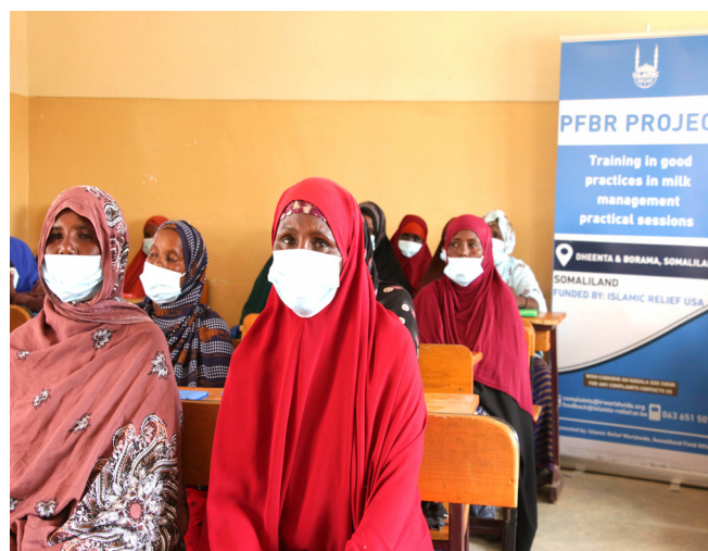
Milk management training to business women in Dheenta Somaliland