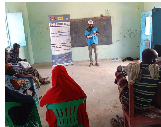
Training of Biyogadud village water management committee in Iskushuban district of Puntland, Somalia