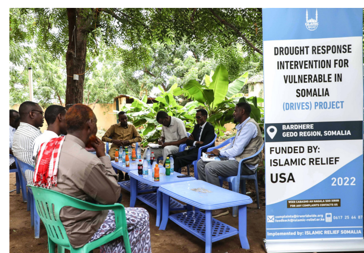
Launching of Drought Response Project in Bardhere, Gedo-Somalia