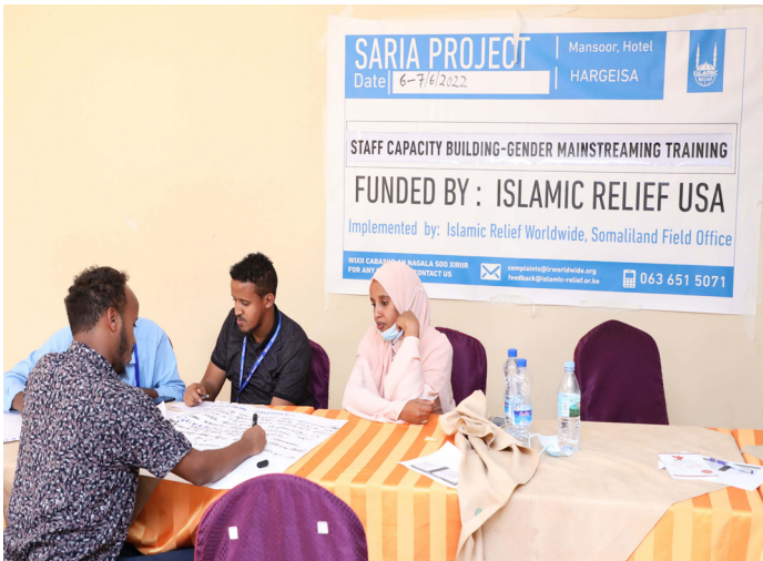
Staff capacity building on Gender Mainstreaming in Hargeisa, Somaliland