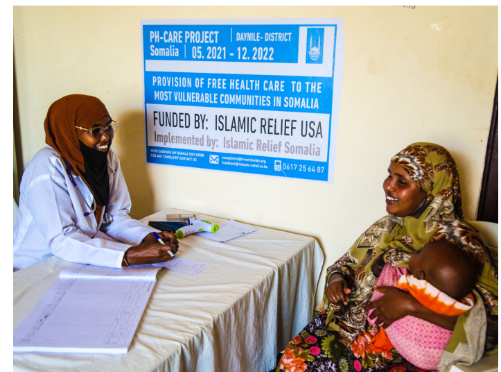
Provision of health support to the vulnerable patients in Mogadishu, Somalia