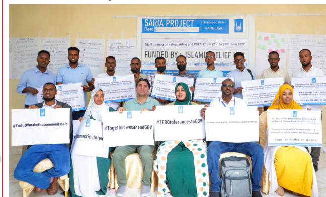
Staff training on safeguarding and PSEAH in Hargeisa, Somaliland