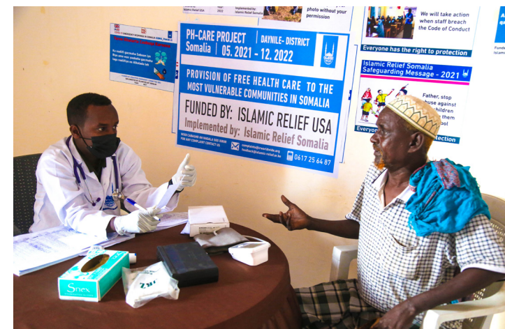
Provision of health support to the vulnerable patients in Mogadishu, Somalia