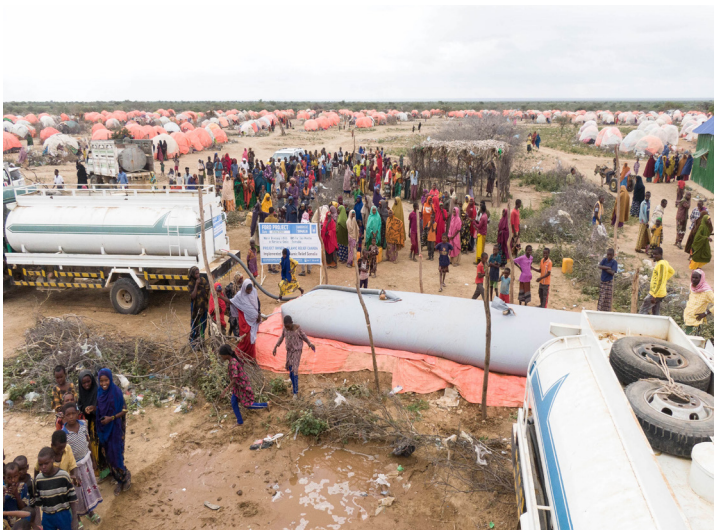
Provision of clean water to IFTIN IDP Camps in Bardhere, Somalia