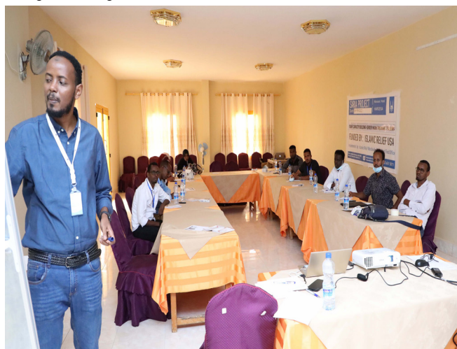
Staff capacity building on Gender Mainstreaming in Hargeisa, Somaliland