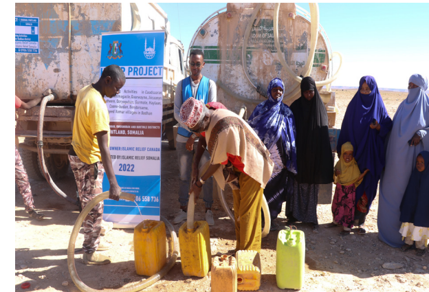
Water trucking activities to the drought affected HHs in Badhan district of Puntland, Somalia