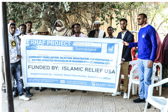
Registration of 531 Waheen Market fire affected households in Somaliland