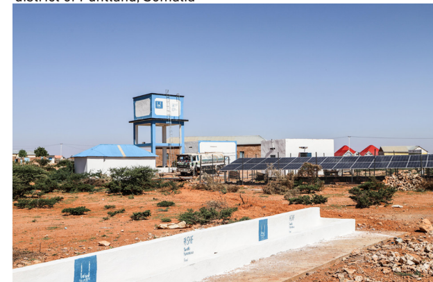
IR Somalia rehabilitated Borehole in Burtinle of Puntland, Somalia