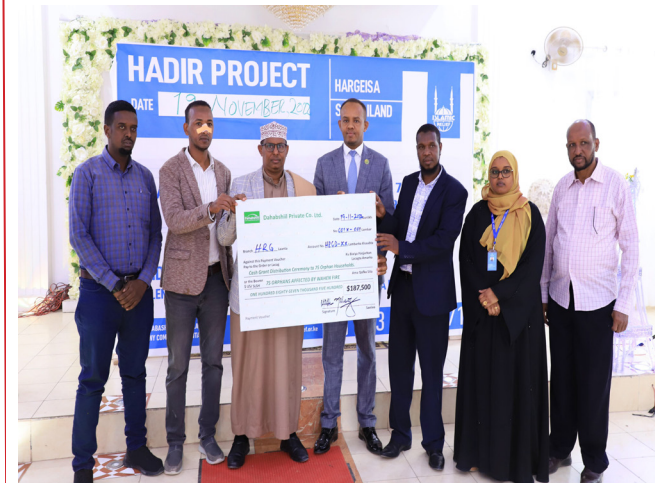
Cash Grant distribution ceremony to 75 orphan families in Hargeisa