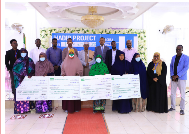
Cash Grant distribution ceremony to 75 orphan families in Hargeisa