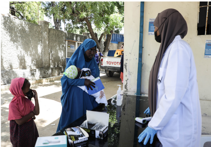
Provision of health support to the vulnerable patients in Mogadishu, Somalia