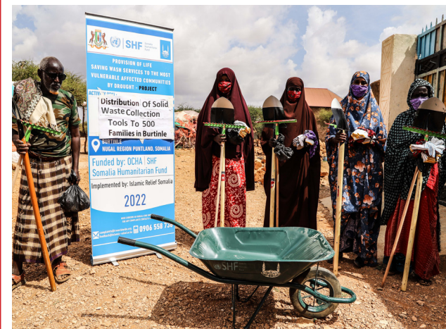
Distribution of solid waste collection tools to 500HHs of Burtinle residents in Puntland, Somalia