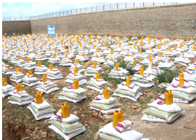
Distribution of food packages to the drought affected families in Baidoa