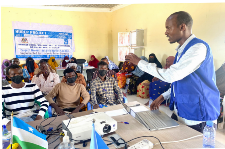
Training on Gender & Safeguarding for 45 community members & local authorities in Iskushuban district of Puntland, Somalia