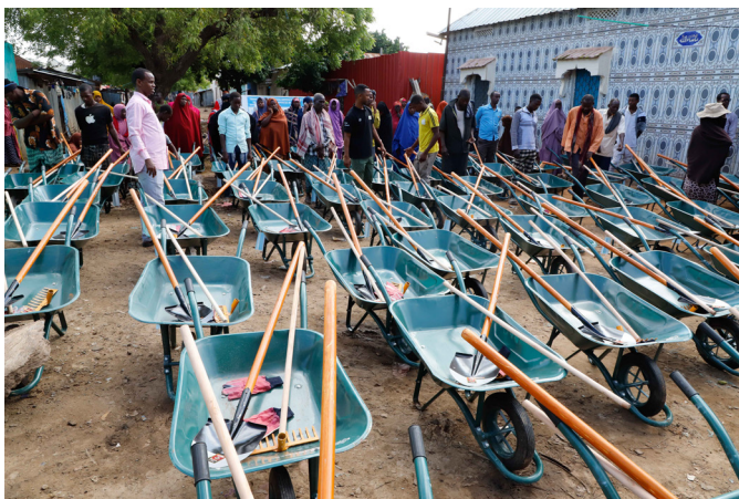
Distribution of solid waste collection tools to 2,100HHs in Balcad Somalia