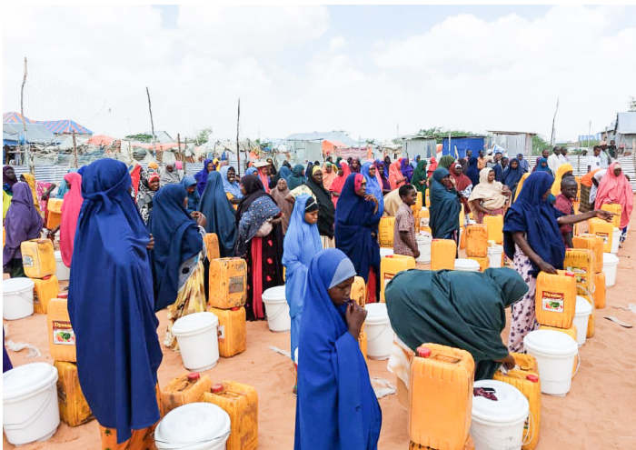
Distribution of hygiene kits to the drought affected HHs in Beledweyne, Somalia