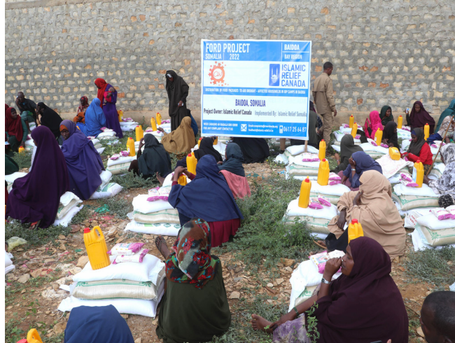
Distribution of food packages to the drought affected families in Baidoa