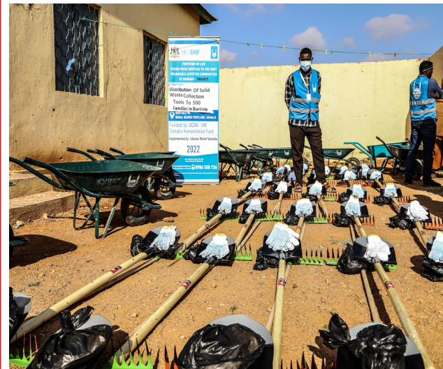
Distribution of solid waste collection tools to 500HHs of Burtinle residents in Puntland, Somalia