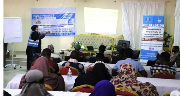
Training on Gender & Safeguarding to the community members and local authorities in Puntland, Somalia