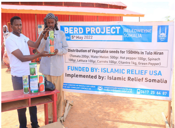
Distribution of farm seeds to the farmers in Beledweyne-Somalia