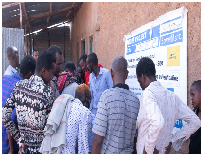
Registration of Unconditional Cash Transfers to the drought affected communities in Togdher region, Somaliland-Fund from SIDA