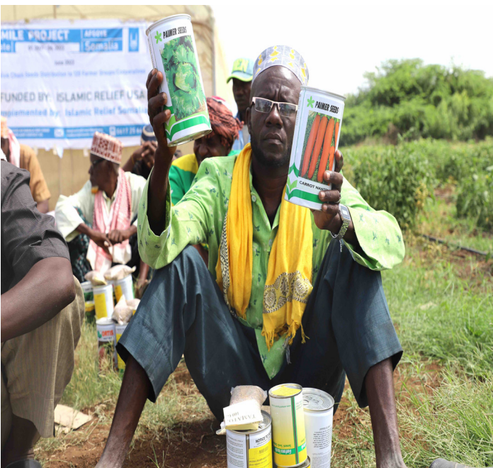
Distribution of farm seeds to the farmers in Lower Shabelle, Afgoye-Somalia