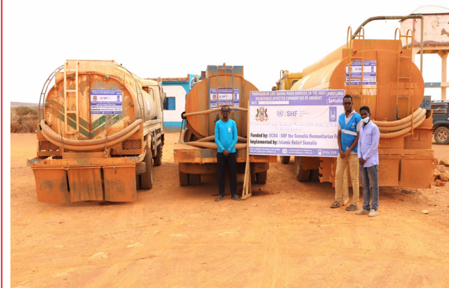
Launch of 2 months water trucking activities in Burtinle, Puntland under OCHA -SHF funded project