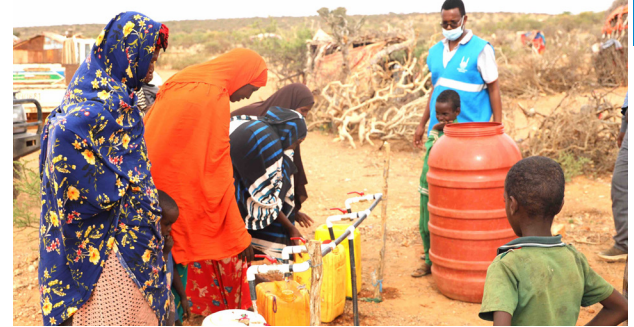
Provision of clean water to Burtinle villagers in Puntland, Somalia

“Islamic Relief’s trainings and the capacity building had transformed the old-style way we used to trade the milk. Now, things have enhanced interims of sanitary and milk processing methods. Thanks to Islamic Relief and the donor for the delightful assistance”, says Ms. Saafi.