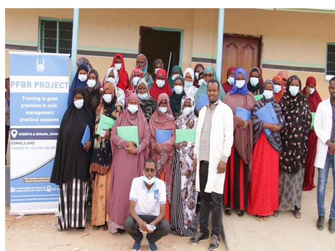
Milk management training to business women in Dheenta Somaliland