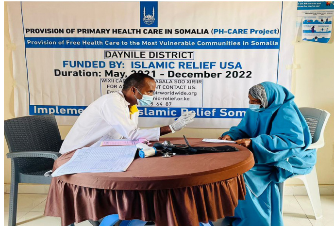
Provision of health support to the vulnerable patients in Somalia