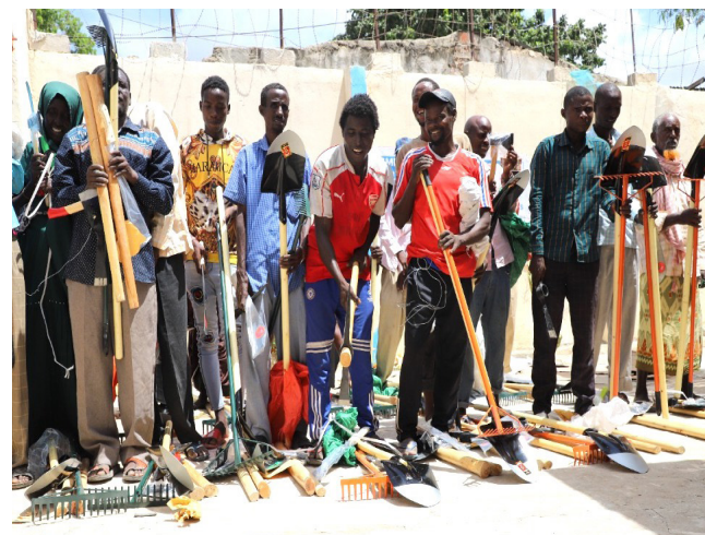
Distribution of farm tools to 100 farmers in Lower Shabelle, Afgoye