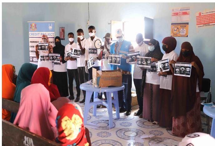
Covid-19 awareness and advocacy activities in Qardho Puntland, Somalia