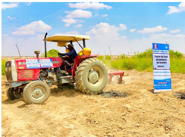
Land ploughing for Midgale village farmers in Puntland Somalia