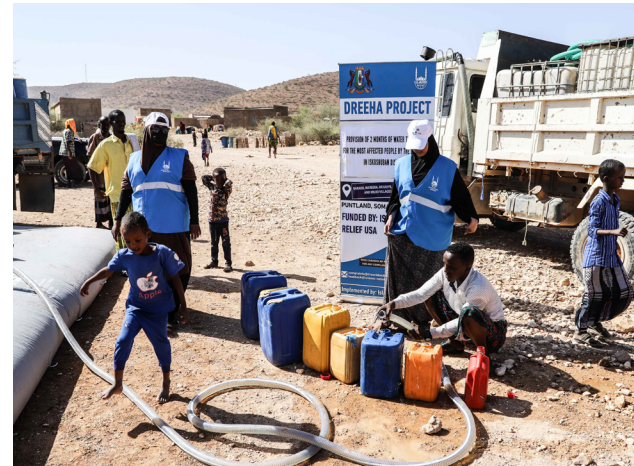
Water trucking activities to the drought affected HHs in Puntland