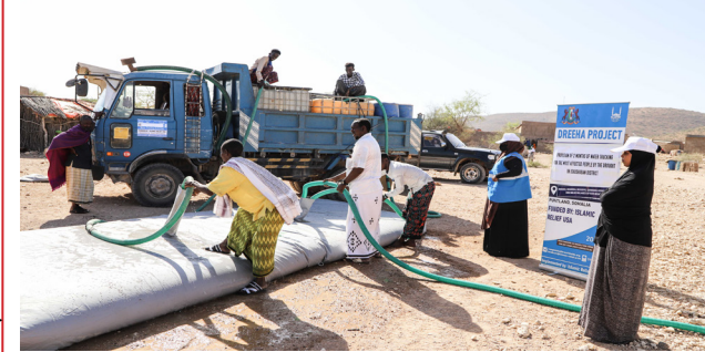
Water trucking activities to the drought affected HHs in Puntland

This project has enormous means to the society of Somalia and assisted over 40,000 rightsholders in Bari region of Puntland, Somalia.