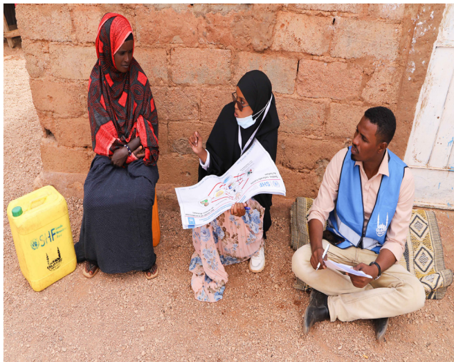
Hygiene promotion campaigns in the IDP camps in Burtinle Puntland