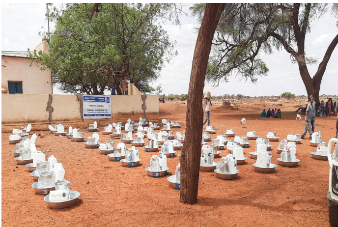
Distribution of hygiene kits to the drought affected households in Somaliland