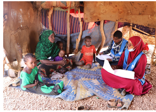
Hygiene promotion campaigns in the IDP camps in Burtinle, Puntland