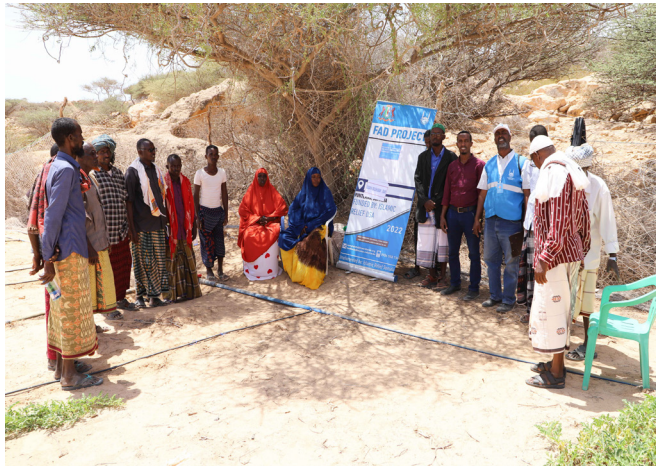
Drip irrigation training to 36 farmers in Puntland, Somalia