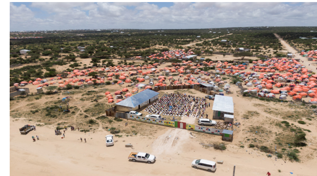
Distribution of food packages to the drought affected people in the outskirts camps of Mogadishu, Somalia