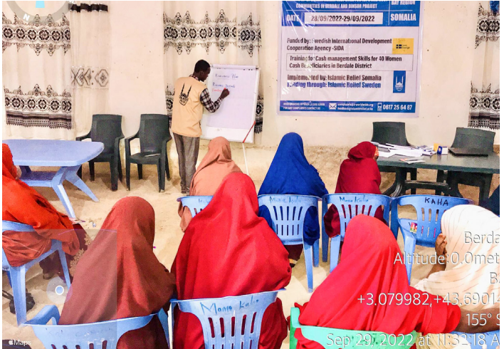
Cash management skills training for 40 women rightsholders in Berdale Bay region, Somalia