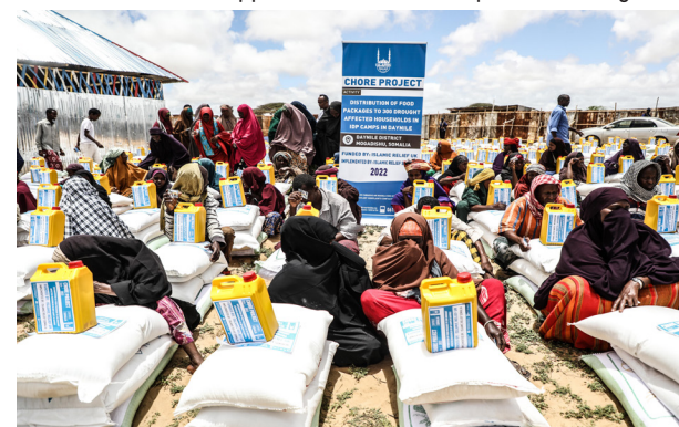
Distribution of food packages to the drought affected people in the outskirts camps of Mogadishu, Somalia