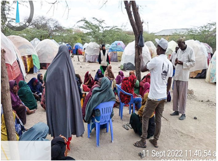
Protection and safeguarding awareness training to the IDP camps in Berdale Bay region, Somalia