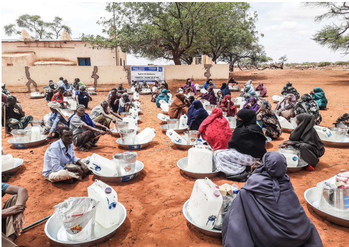
Distribution of hygiene kits to the drought affected households in Somaliland