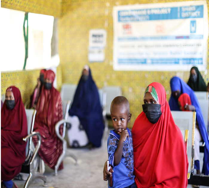
Provision of health support to the vulnerable patients in Mogadishu, Somalia