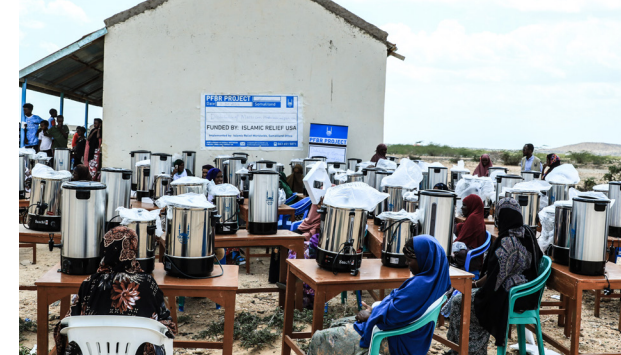
Distribution of Mazzi cans and other utensils to 41 milk vendors in Borama, Somaliland