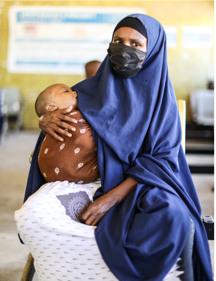
Provision of health support to the vulnerable patients in Mogadishu, Somalia