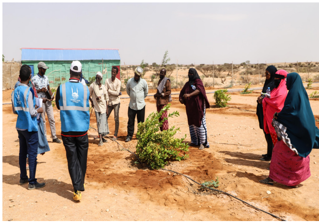
Drip irrigation training to 36 farmers in Puntland, Somalia