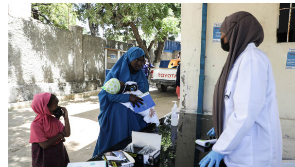
Provision of health support to the vulnerable patients in Mogadishu