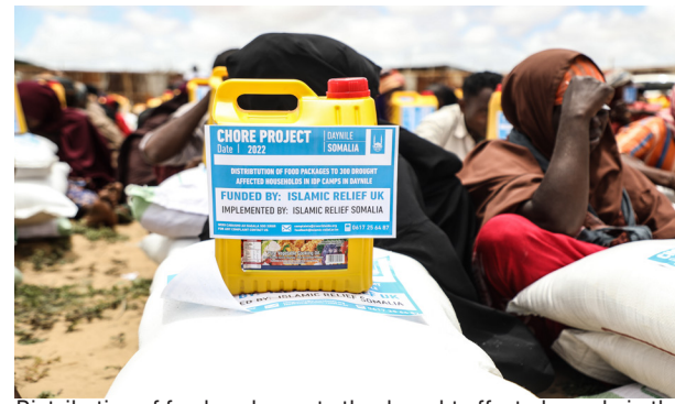
Distribution of food packages to the drought affected people in the outskirts camps of Mogadishu, Somalia