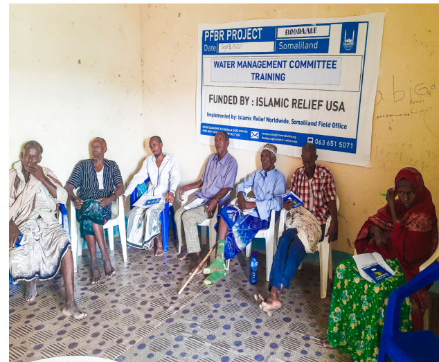
Water management committee training in Bodaale village, Somaliland