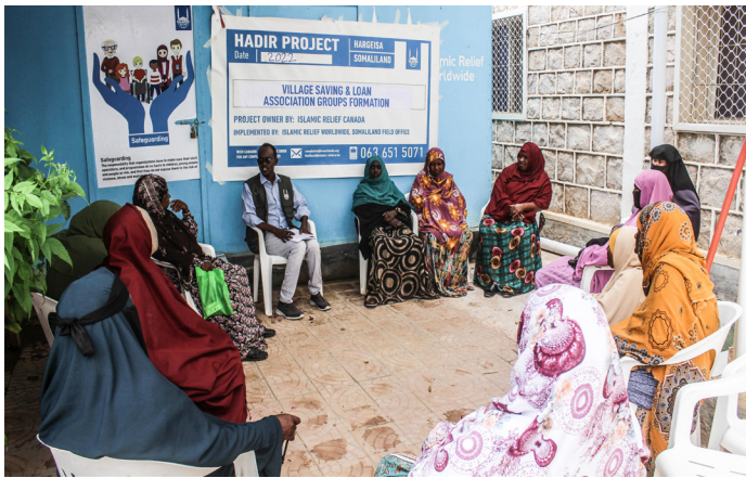
Village Saving & Loans Association Groups formation in Hargeisa, Somaliland