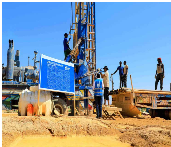
Islamic Relief drilled a deep borehole in Wardher village of Puntland, Somalia