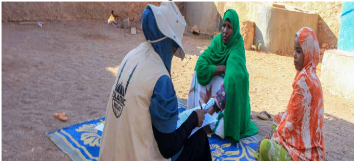
Orphan's home visit and assessment in Hargeisa, Somaliland.