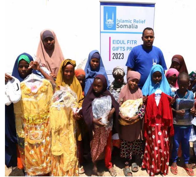
Provision of Eidul Fitr Gifts to the orphan children in Balcad, Somalia