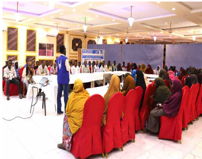
Start up capital cash money support to 450 rights-holders in Beletweyne