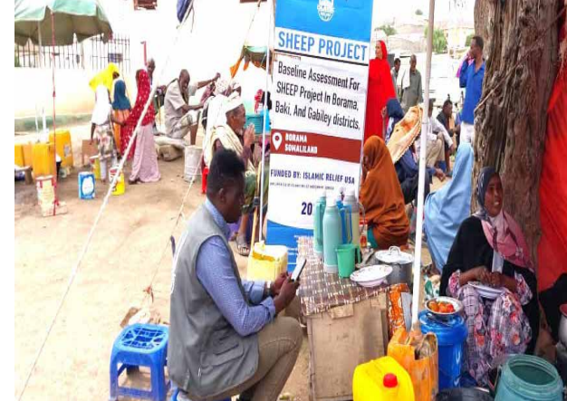
Baseline assessment for rights-holders in Borama, Somaliland