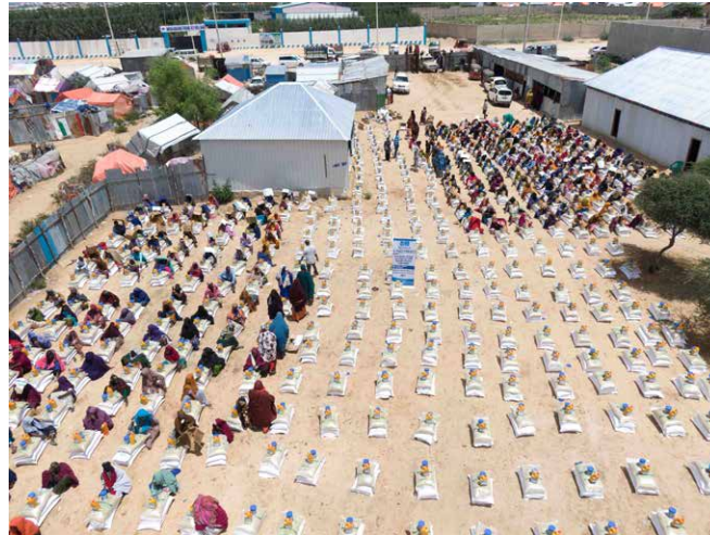
Food packages to 1,000 families in Daynile IDP camps in Mogadishu