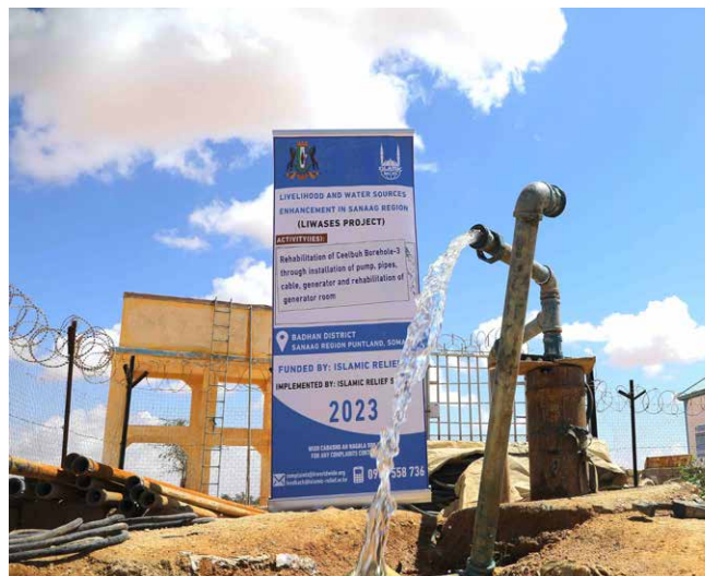
Rehabilitation of Ceelbuh borehole-3 in Badhan district of Puntland.