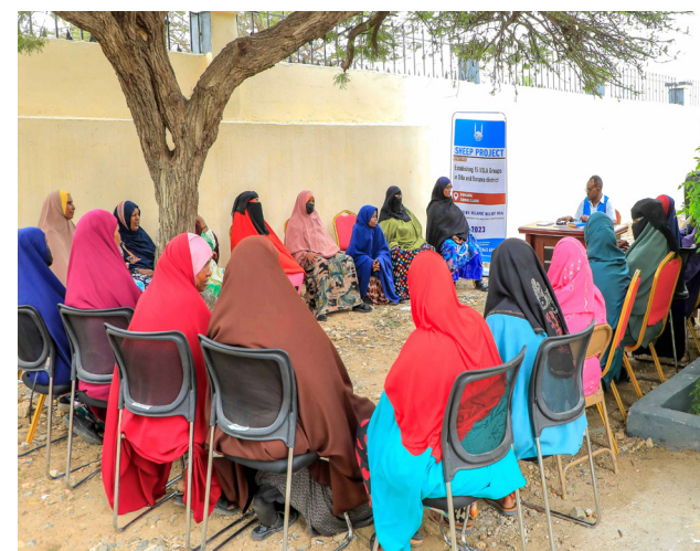
Establishing of 15 VSLAs women groups in Dilla and Borama districts of Somaliland