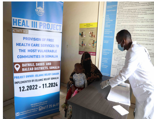
Provision of health support to the vulnerable patients in Mogadishu