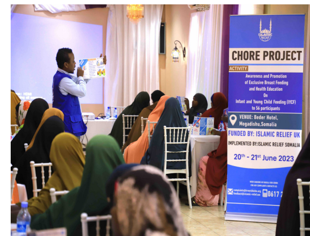
Provision of training about Infants and Young Child Breastfeeding to 50 rights-holders in Daynile district of Mogadishu, Somalia