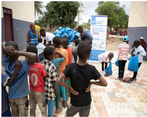
Provision of Eid Gifts to the orphan children in Abubakar A-Sadik Orphanage school in Afgoye, Somalia