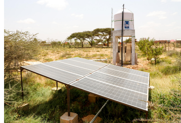
Construction of water tank with solar systems in Qardho district of Puntland, Somalia.