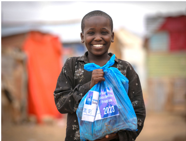
Distribution of Qurbani meat packs to the drought affected families in Garowe Puntland, Somalia.