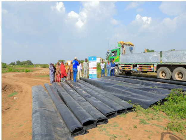
Provision of plastic Geo-membrane to 50 vulnerable households in Magalo-cad village of Somaliland.