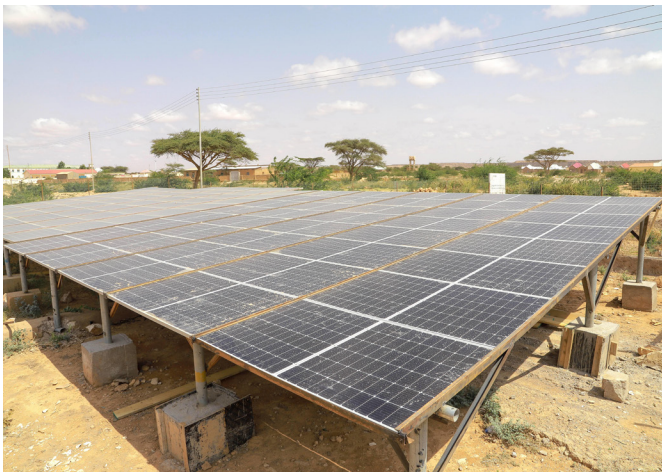
Drilling and equipping of a new borehole in Qardho district of Puntland, Somalia