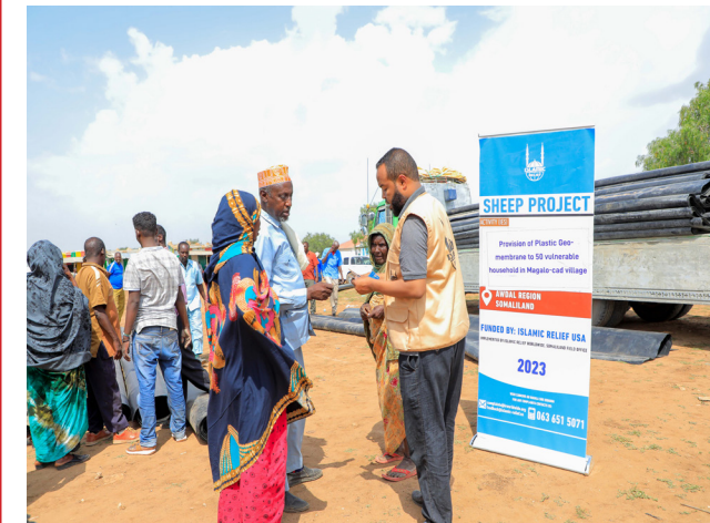
Provision of plastic Geo-membrane to 50 vulnerable households in Magalo-cad village of Somaliland.