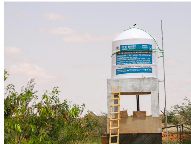
Construction of water tank with solar systems in Qardho district of Puntland, Somalia.