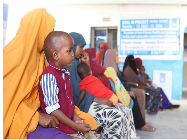
Provision of health support to the vulnerable patients in Mogadishu