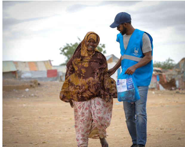
Distribution of Qurbani meat packs to the drought affected families in Garowe Puntland, Somalia.