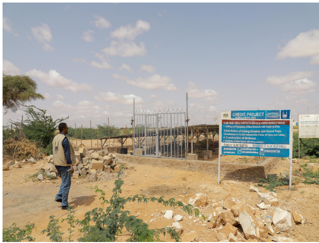
Drilling and equipping of a new borehole in Qardho district of Puntland, Somalia