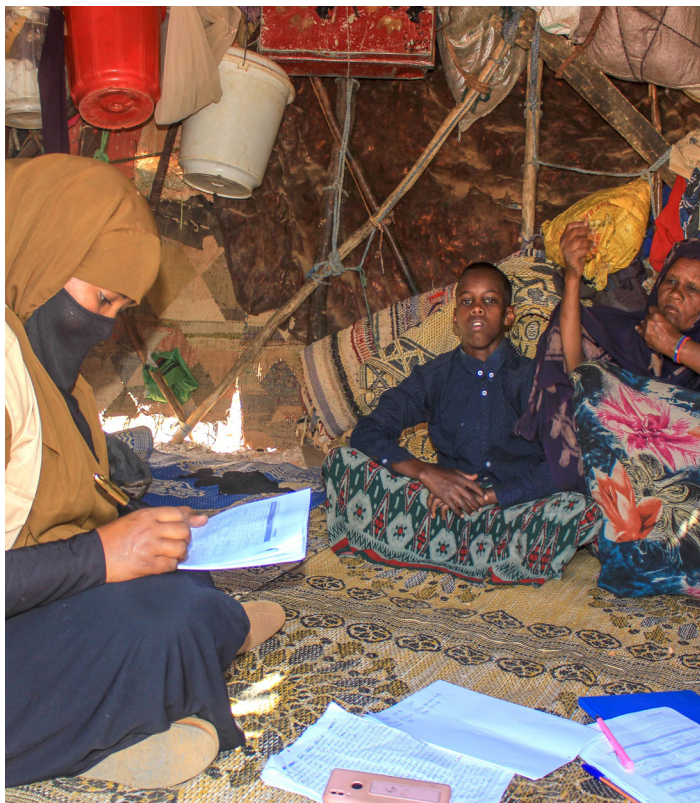
Orphan's home visit and assessment in Hargeisa, Somaliland.