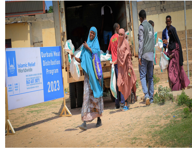
Distribution of Qurbani meat packs to the drought affected families in Hargeisa, Somaliland