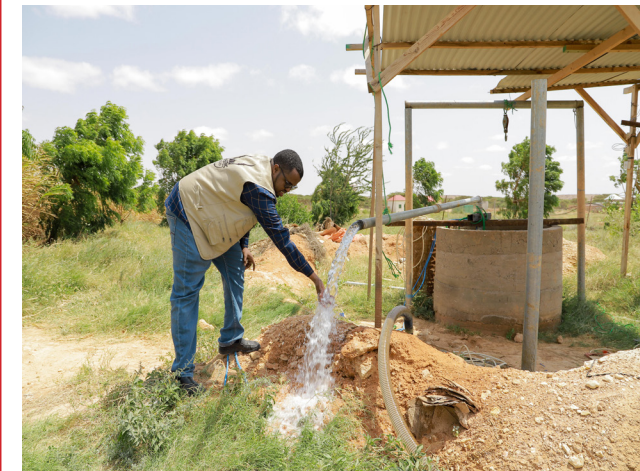
Rehabilitation of shallow wells in Kubo village of Qardho district in Puntland, Somalia.