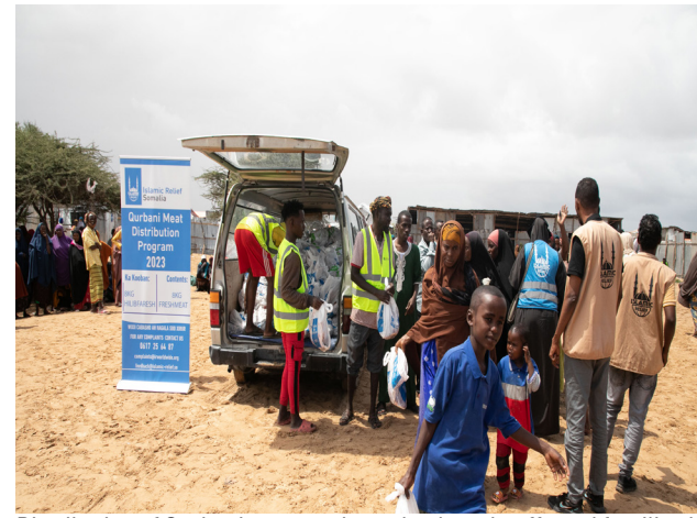
Distribution of Qurbani meat packs to the drought affected families in Daynile IDP camps in Mogadishu, Somalia.