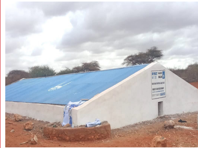
Rehabilitation of berkads in Ballicalante villages of Somaliland