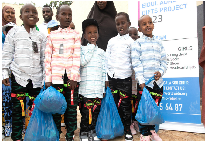
Provision of Eid Gifts to the orphan children in Abubakar A-Sadik Orphanage school in Afgoye, Somalia