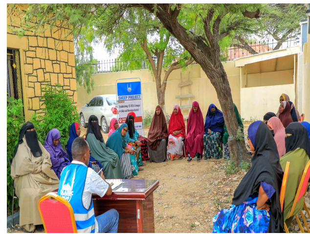
Establishing of 15 VSLAs women groups in Dilla and Borama districts of Somaliland