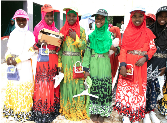
Provision of Eid Gifts to the orphan children in Abubakar A-Sadik Orphanage school in Afgoye, Somalia