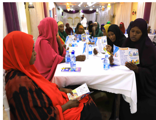
Provision of training about Infants and Young Child Breastfeeding to 50 rights-holders in Daynile district of Mogadishu, Somalia