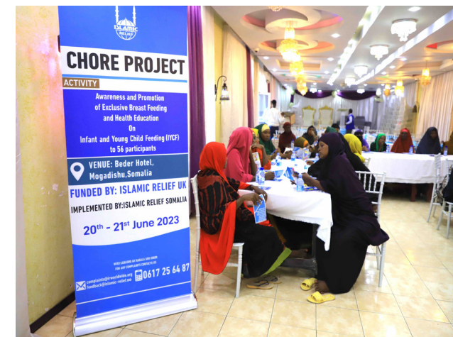
Provision of training about Infants and Young Child Breastfeeding to 50 rights-holders in Daynile district of Mogadishu, Somalia