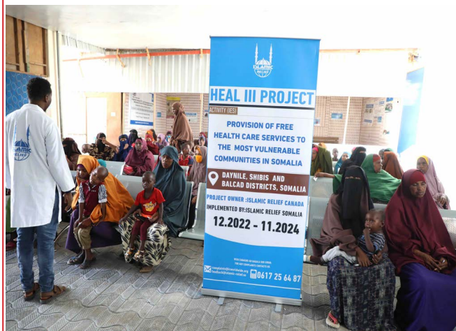
Provision of health support to the vulnerable patients in Mogadishu