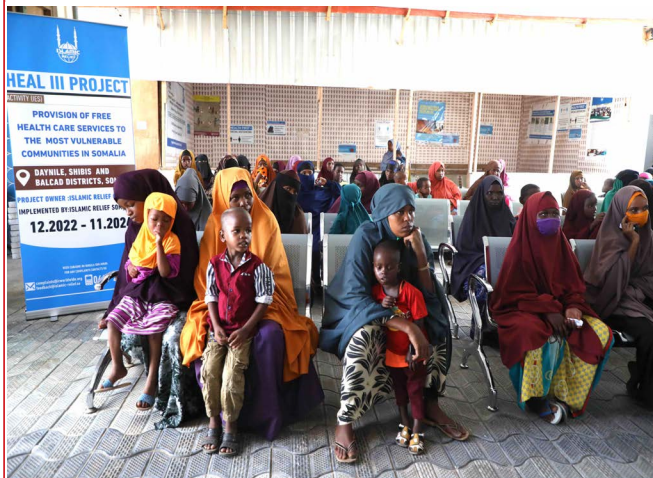
Provision of health support to the vulnerable patients in Mogadishu