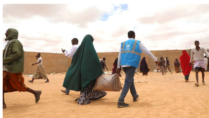
Provision of Ramadan food packages to the vulnerable families in Garowe