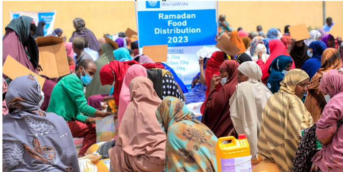
Provision of Ramadan food packages to the vulnerable families in Hargeisa