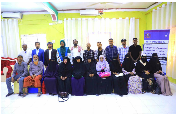
Protection and safeguarding training to 100 Yemeni refugees in Qardho district of Puntland, Somalia