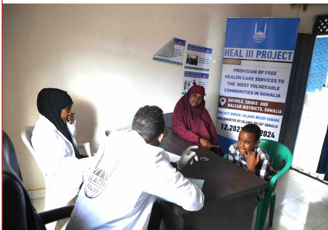
Provision of health support to the vulnerable patients in Mogadishu