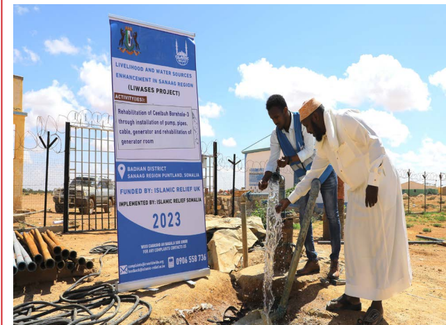
Rehabilitation of Ceelbuh village borehole in Badhan district, Puntland