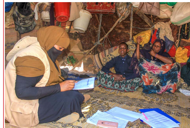
Orphans' home visit and assessment in Hargeisa, Somaliland