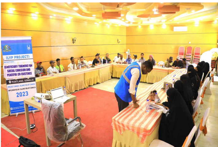
Rights-holders training for social cohesion and peaceful-coexistence in Qardho district of Puntland, Somalia