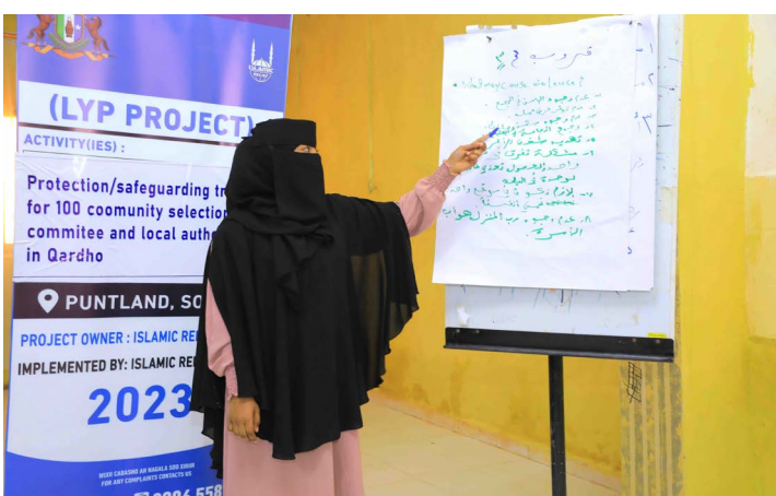
Protection and safeguarding training to 100 Yemeni refugees in Qardho district of Puntland, Somalia