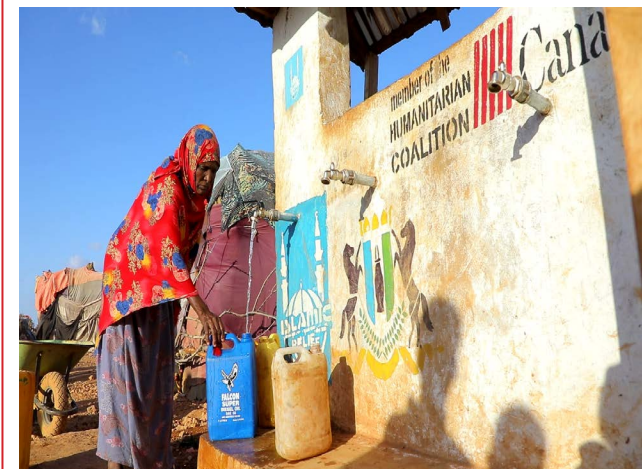
Provision of clean and safe water to the drought affected families in Danwadag village in Burtinle district of Puntland, Somalia