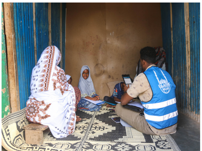
Child Welfare team carrying out house assessment in Somaliland