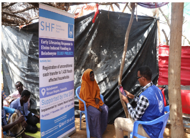
IRS Distributed unconditional cash to 1,430 HHs in 6 villages under Beledweyne, Somalia