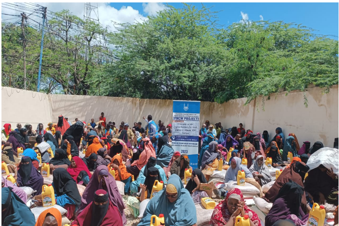
Distribution food packs to 300 vulnerable households in Eyle1 & Doonlawe IDPs & Dhagaxtur & If iyo Akhiro Villages under Afgoye District.