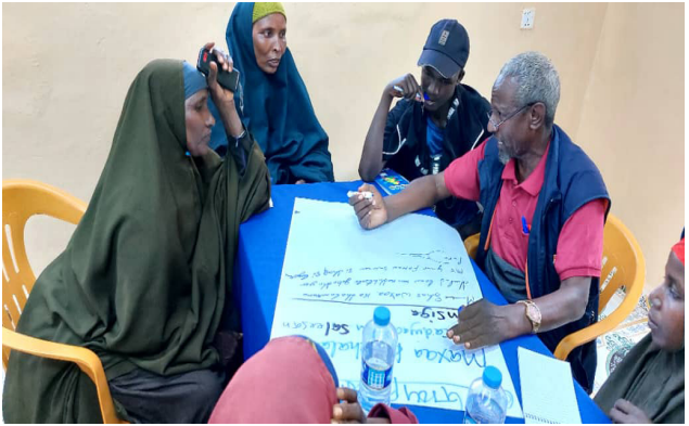
Two days training for community leaders (in the IDPs) and Host community on protection (GBV) in Baido, Somalia