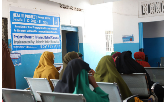
Provision of health support to the vulnerable patients in Mogadishu