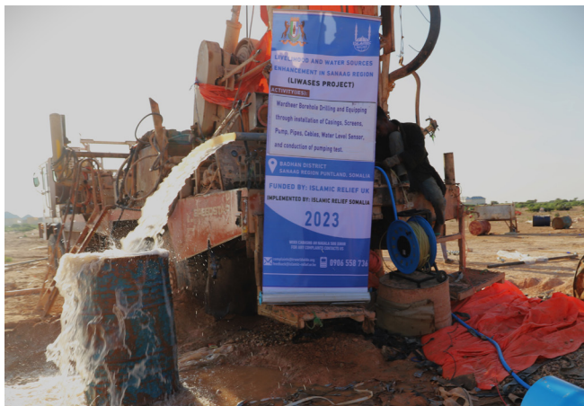
Drilling and equipping of a new borehole in Wardher village of Puntland, Somalia