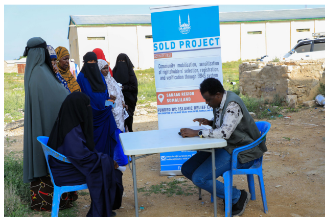
Community mobilization, sensitization and registration in Erigavo IDPS of Sanag region, Somaliland