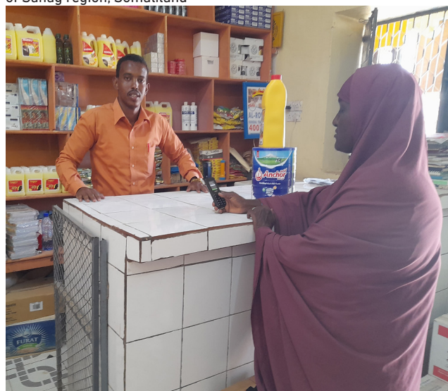
IRS released the first cycle of the UCT to 822 HHs in Butrinle District of Puntland