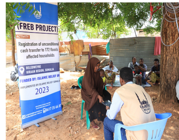
Registration of 172 HHs in Beledweyne District for unconditional cash transfer under FREB Project