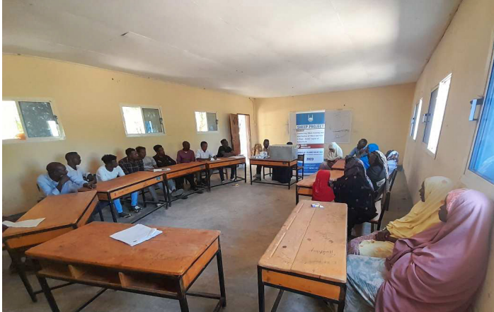
VSLA methodology training In Ruqi and Borama district, Somaliland