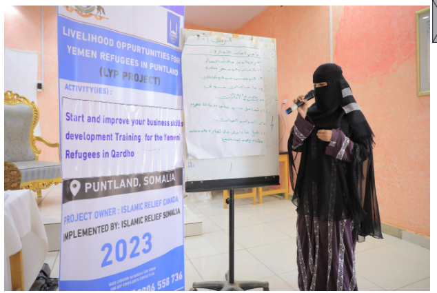
Start and Improve Your Business capacity building training for 60 HHs from the Yemeni Refugees in Qardho District