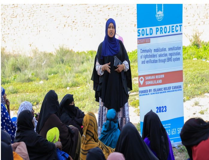
Community mobilization, sensitization and resgistration in Erigavo IDPS of Sanag region, Somaliland