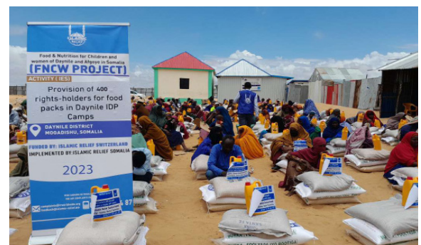
Distribution nutritious supplementary food for 1000 HHs in Daynile IDP Camp, Muggidhso, Somalia