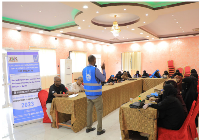
Start and Improve Your Business capacity building training for 60 HHs from the Yemeni Refugees in Qardho District