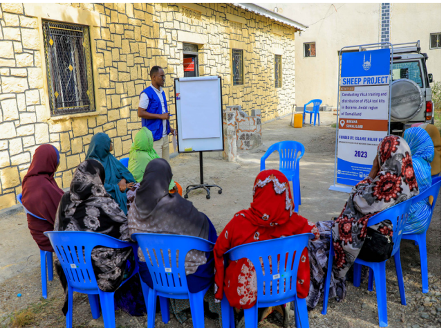
VSLA methodology training In Ruqi and Borama district, Somaliland