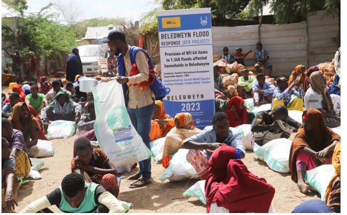
Provision of NFI kits to the floods affected families in Beledweyne, Somalia