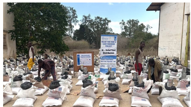
Provision of food packages to the droughts families in Balcad, middle Shabelle region, Somalia