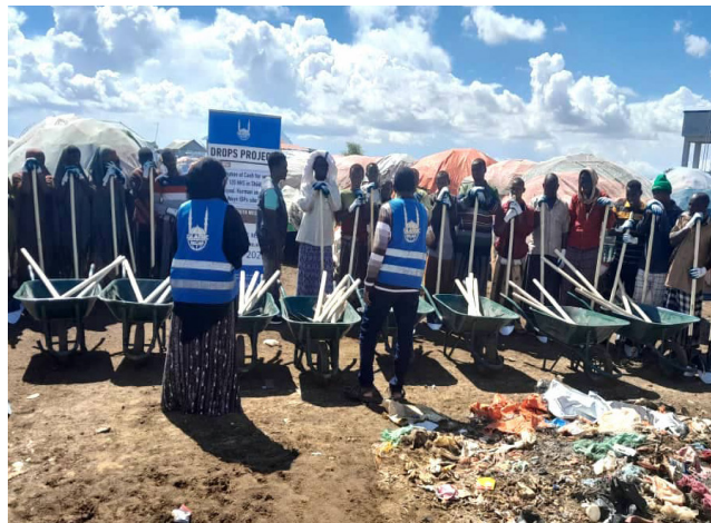
Provision of cash for work hand tools to 120 droughts affected families in the camps of Baidoa.