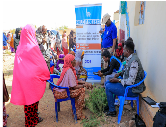
Community mobilization, sensitization and resgistration in Oog district of Somaliland