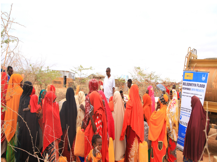
Water trucking activities to the floods affected families in Beledweyne, Somalia