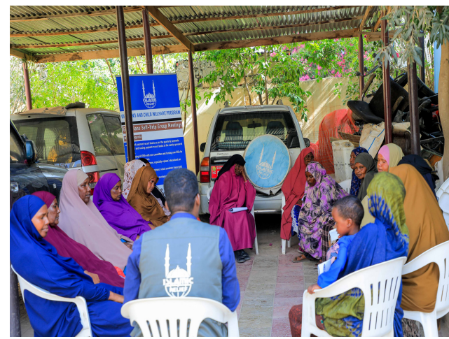
Registration of Self Help Groups from the orphan families in Hargeisa, Somaliland