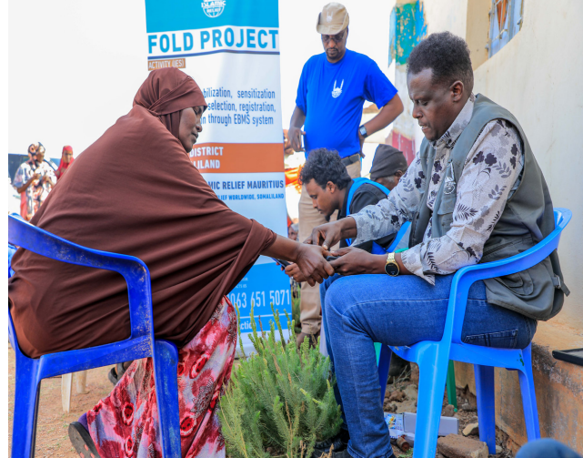
Community mobilization, sensitization and resgistration in Oog district of Somaliland