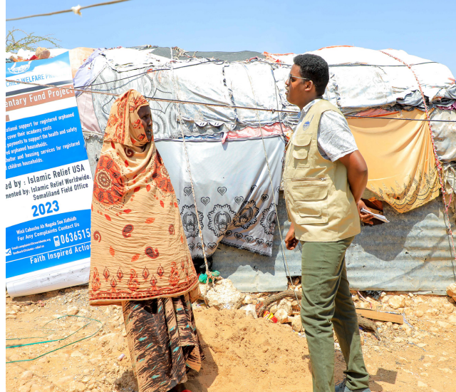
Shelter and housing assessment mission to the orphan families in Hargeisa, Somaliland