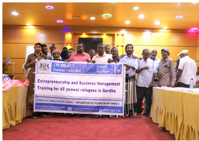
Entrepreneurship & business management training for 60 Yemeni refugees in Qardho district of Puntland, Somalia