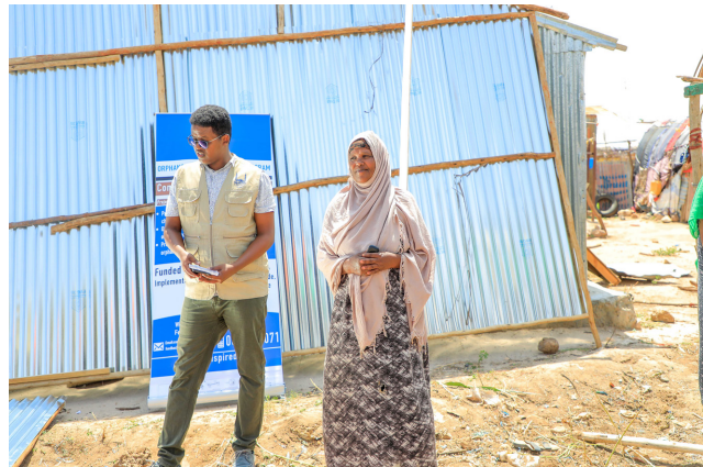
Shelter and housing assessment mission to the orphan families in Hargeisa, Somaliland