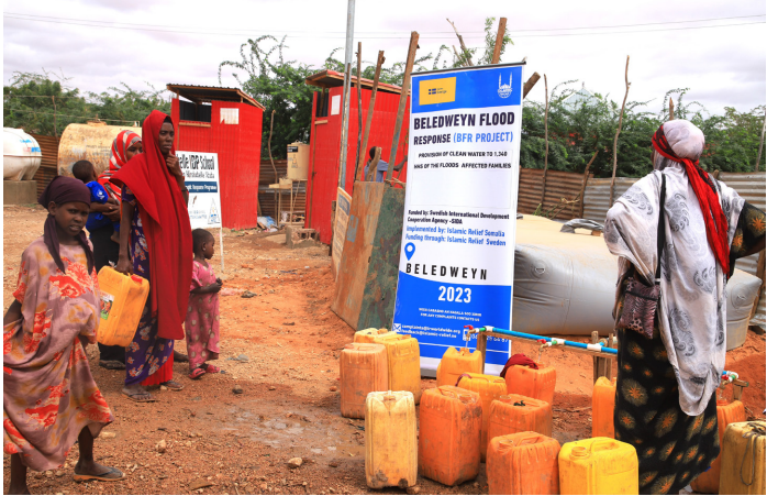
Water trucking activities to the floods affected families in Beledweyne, Somalia