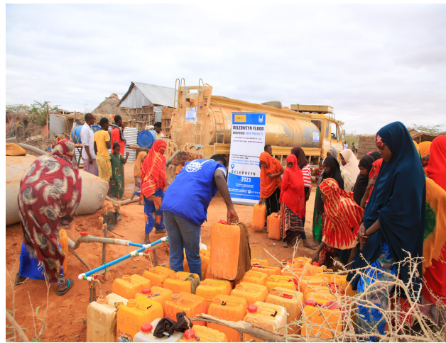
Water trucking activities to the floods affected families in Beledweyne, Somalia