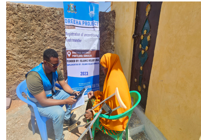
Registration of the droughts affected families in Burtinle district of Puntland, Somalia for Unconditional Cash Transfers-UCT