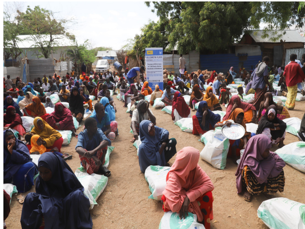
Provision of NFI kits to the floods affected families in Beledweyne, Somalia