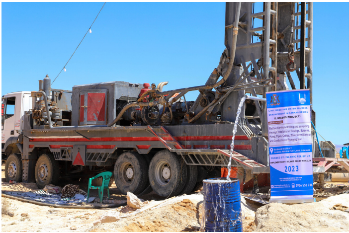
Drilling and equipping of a new borehole in Badhan district of Puntland, Somalia