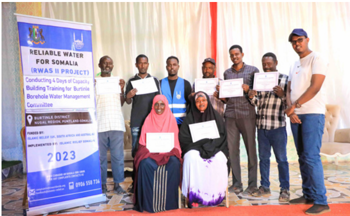
Capacity building training for Burtinle water management committee