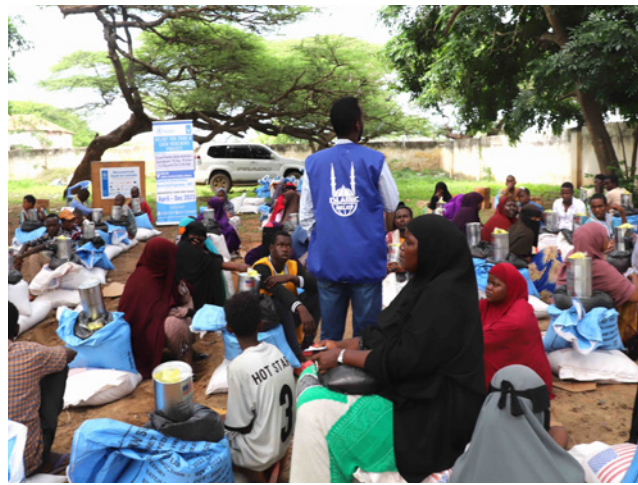
Distribution of food packages to droughts affected families in Balcad, Middle Shabelle region