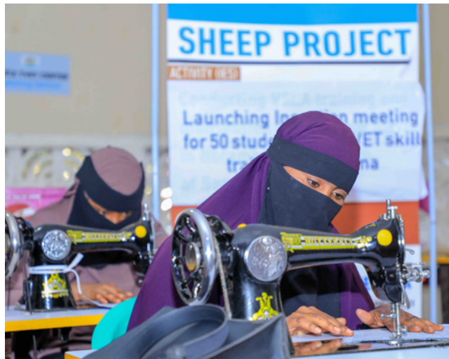
Tailoring skills training in Baroma, Somaliland.