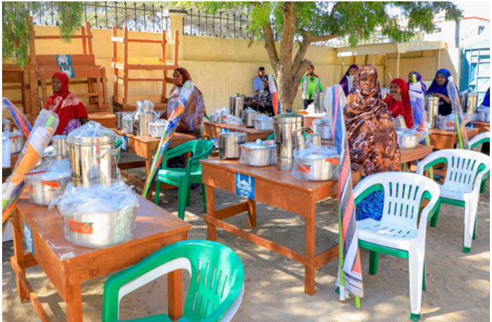
Provision of milk equipment to 150 milk business women in Awdal region of Somaliland