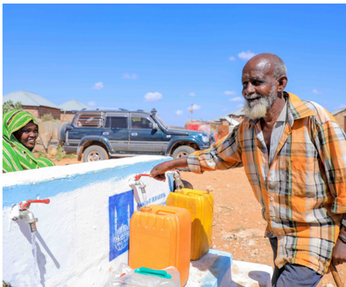
A man, from the residents of Burtinle, Puntland, collects water from newly constructed water kiosk in his village