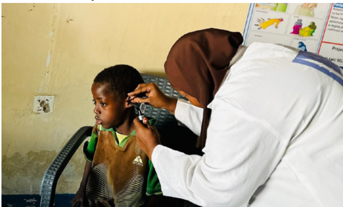
Provision of health support to the vulnerable patients in Balcad