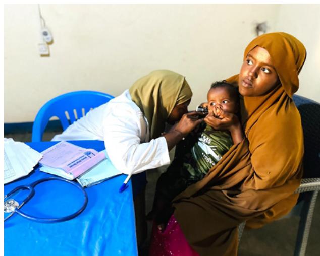
Provision of health support to the vulnerable patients in Balcad