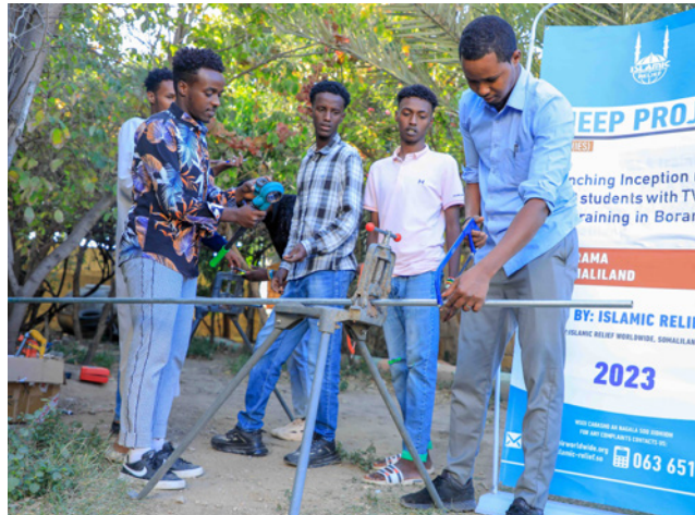
Technical Vocational Educational Training (TVET) to the students in Baroma, Somaliland