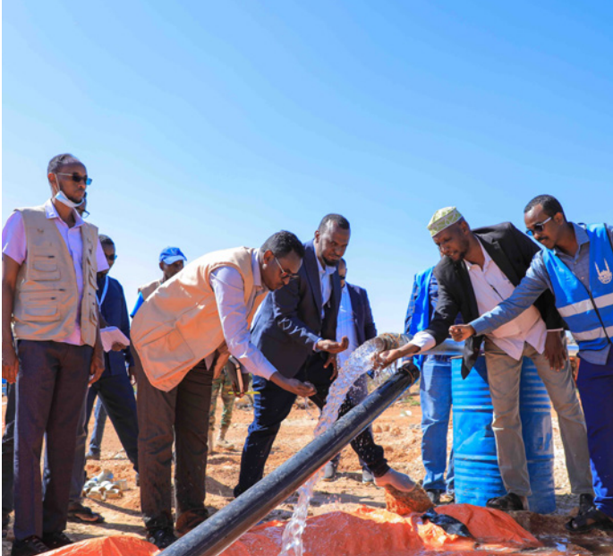
Drilling and completion of a new borehole in Burtinle district of Puntland