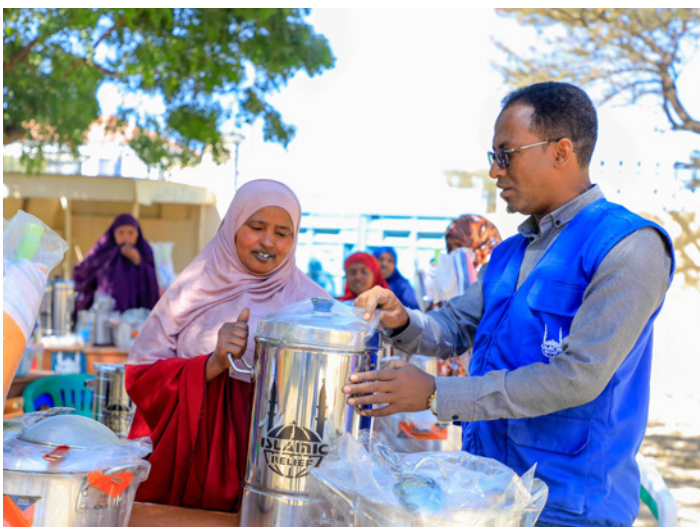
Provision of milk equipment to 150 milk business women in Awdal region of Somaliland