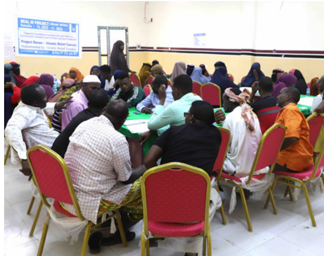
Protection on Gender Based Violence and safeguarding training in Bal'ad Middle Shabelle region, Somalia