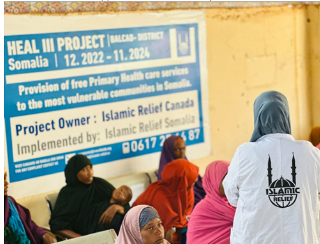
Provision of health support to the vulnerable patients in Balcad