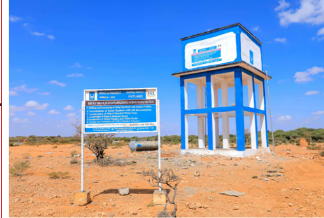
The photo of the successfully completed Burtinle borehole, Puntland, Somalia