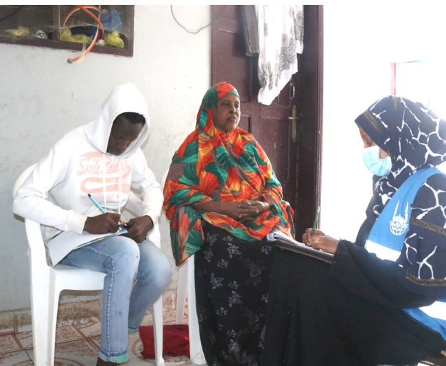
Orphan's home visit and assessment in Hargeisa, Somaliland.