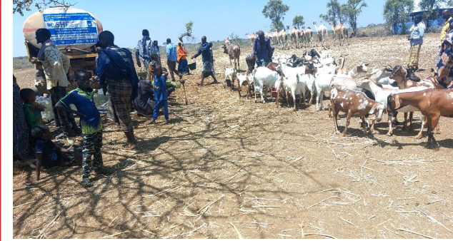
Water trucking activities to the drought affected families in villages under Baidoa district of South West State, Somalia

I usually follow my daily routines, strictly following my daily plans help time accomplish tasks as per required . Outside of work, I enjoy teamwork and as well as work commitment. Thank you.