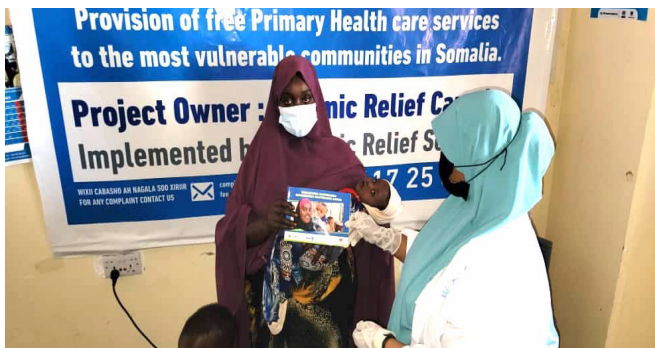
Provision of health support to the vulnerable patients in Mogadishu