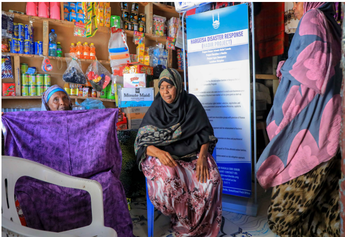
Islamic Relief's support to Waheen fire business families in Hargeisa