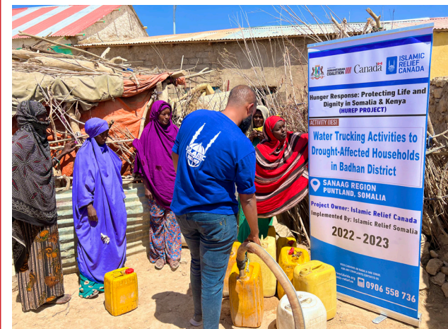
Water trucking activities to the drought affected families in villages under Badhan district of Puntland, Somalia