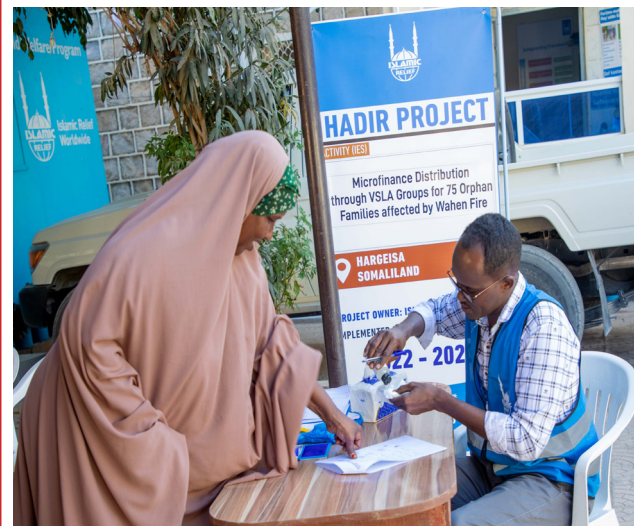
Islamic Relief's support to Waheen fire business families in Hargeisa