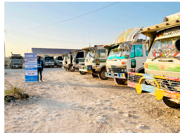
Water trucking activities to the drought affected families in villages under Badhan district of Puntland, Somalia