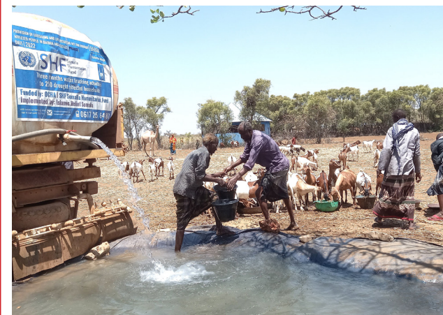
Water trucking activities to the drought affected families in villages under Baidoa district of South West State, Somalia