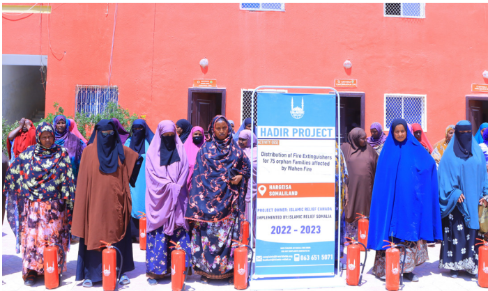
Distribution of Fire Extinguishers to 75 Waheen fire business families in Hargeisa, Somaliland