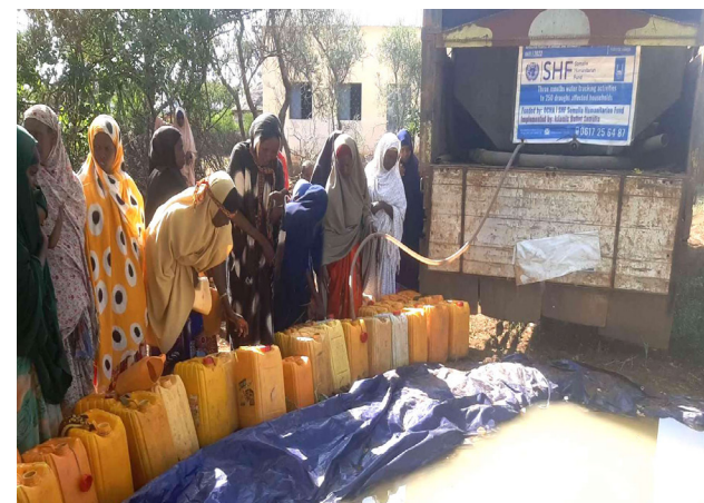
Water trucking activities to the drought affected families in villages under Baidoa district of South West State, Somalia