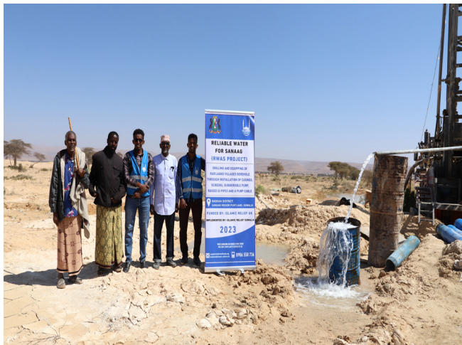
Islamic Relief successfully completes the drilling of Rad & Laako villages borehole in Badhan district of Puntland, Somalia.