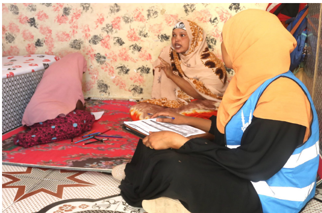
Orphan's home visit and assessment in Hargeisa, Somaliland.