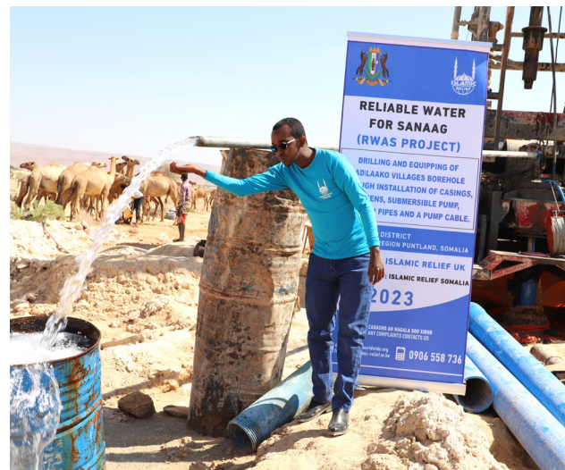
Islamic Relief successfully completes the drilling of Rad & Laako villages borehole in Badhan district of Puntland, Somalia.