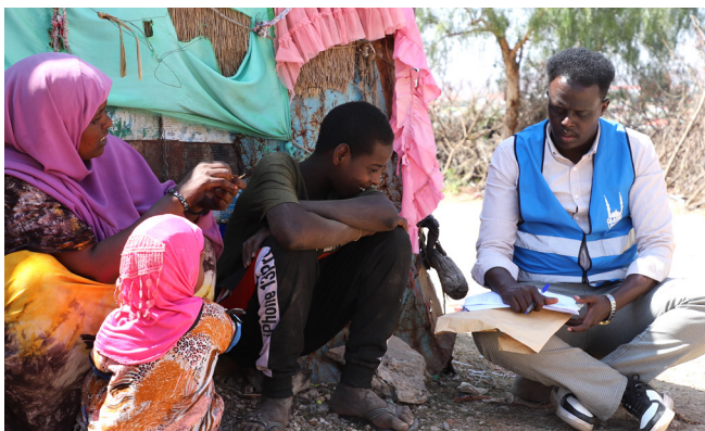
Orphan's home visit and assessment in Hargeisa, Somaliland.