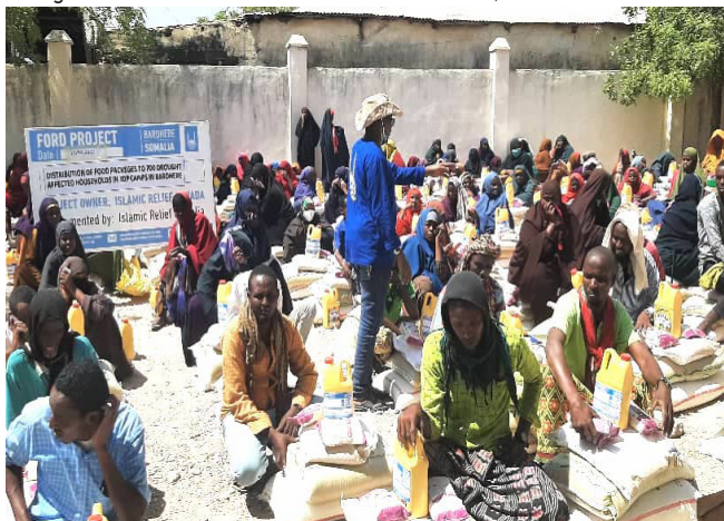
Provision food packages to the drought affected families in Bardhere.