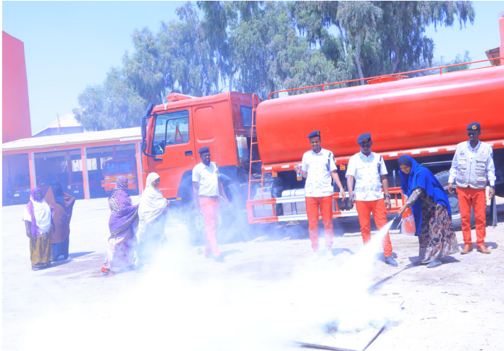
Training of Fire Extinguishers usages to 75 Waheen fire business families in Hargeisa, Somaliland