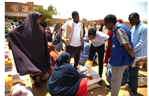
Provision food packages to the drought affected families in Baidoa.