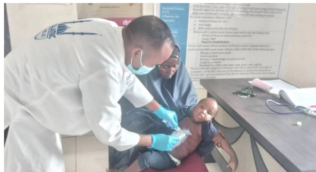
Provision of health support to the vulnerable patients in Mogadishu