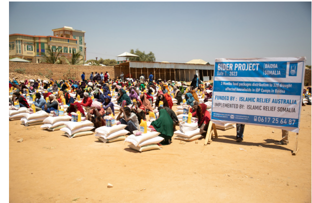
Provision food packages to the drought affected families in Baidoa.