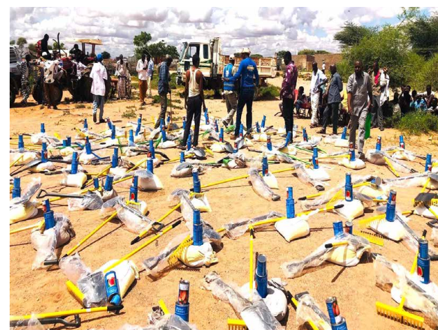
200 farmers in Qoyta village of Togdher region, Somaliland received agricultural inputs from Islamic Relief