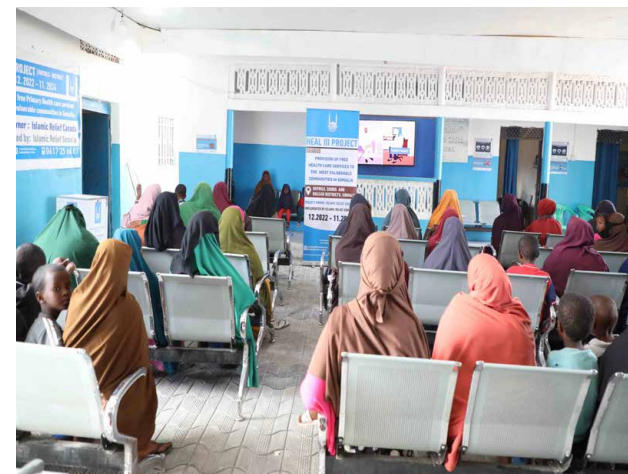
Provision of health support to the vulnerable patients in Mogadishu