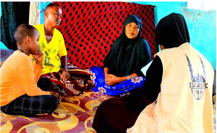
Orphan's home visit and assessment in Hargeisa, Somaliland.