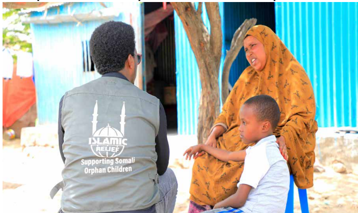
Orphan's home visit and assessment in Hargeisa, Somaliland.