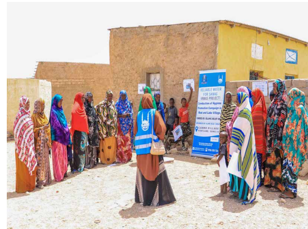
Hygiene promotion campaign in Rad and Laako villages of Puntland.