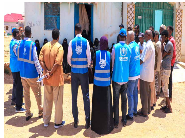
Islamic Relief and UNHCR team in Puntland undertook a joint situational assessment to Yemeni refugees in Qardho district of puntland, Somalia