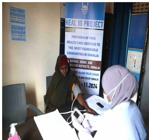
Provision of health support to the vulnerable patients in Mogadishu