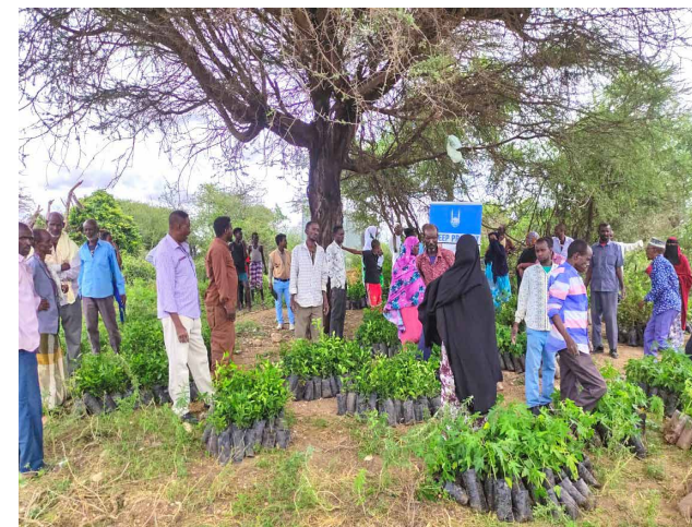
Distribution of drought tolerant fruit seedlings to 50 famers in Baki and Ruqi villages of Somaliland