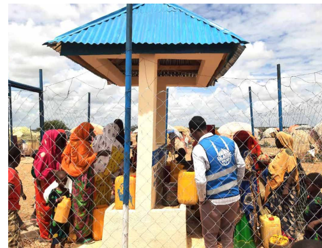
Provision of clean and safe water to the drought affected families in Bardhere IDP camps of Gedo region, Somalia