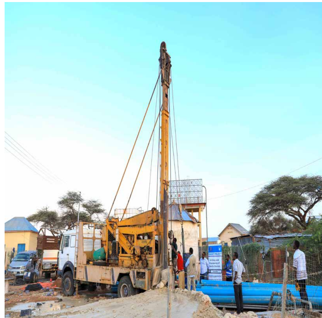
Drilling of a deep borehole in Qardho district of Puntland, Somalia.