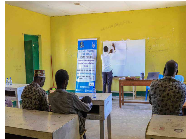
Training of 7 water management committees in Rad and Laako villages of Puntland, Somalia.