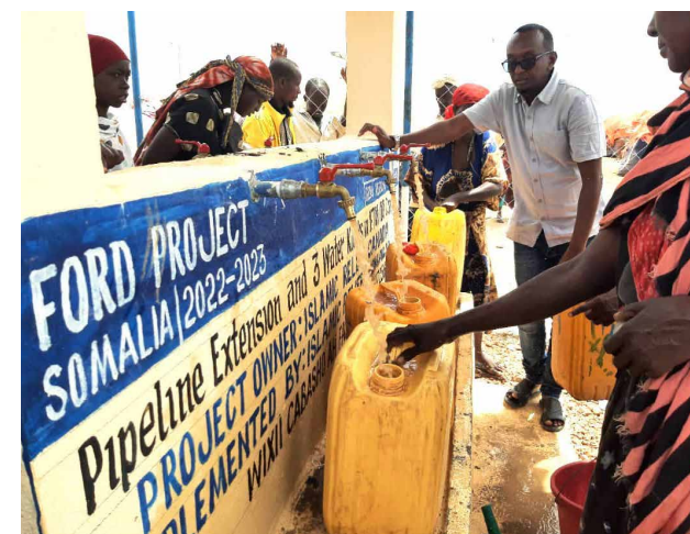
Provision of clean and safe water to the drought affected families in Bardhere IDP camps of Gedo region, Somalia