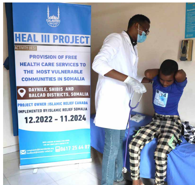
Provision of health support to the vulnerable patients in Mogadishu