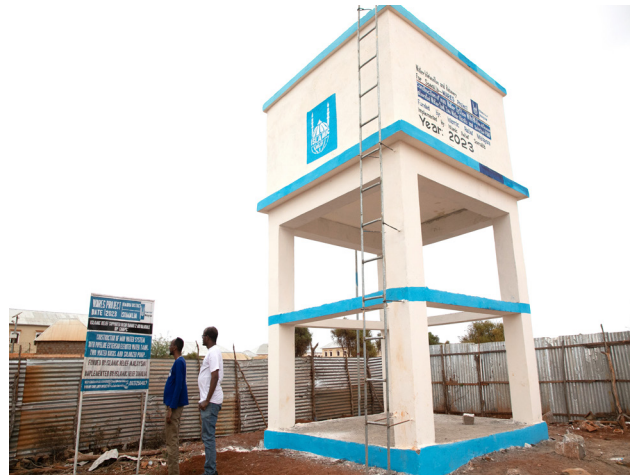
A newly constructed water tank in Baidoa IDP camps, Somalia