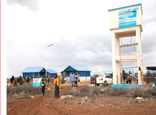
A newly constructed water tank in Baidoa IDP camps, Somalia