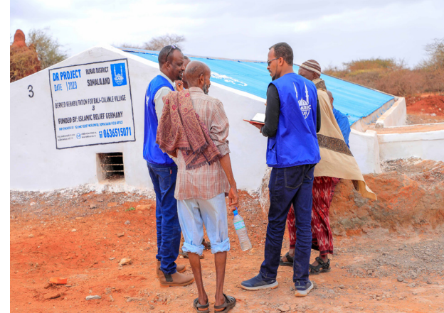
Rehabilitation of berkad in Bali-Calanle village of Burco, Somaliland