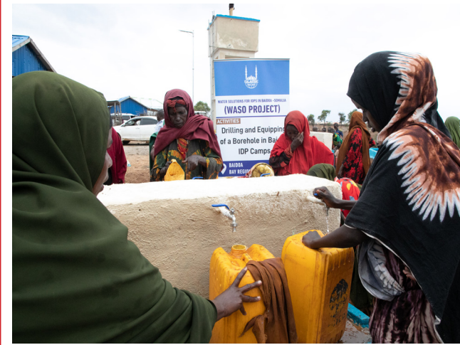
Women fetch water from a newly constructed kiosk in their camp in Baidoa, Somalia