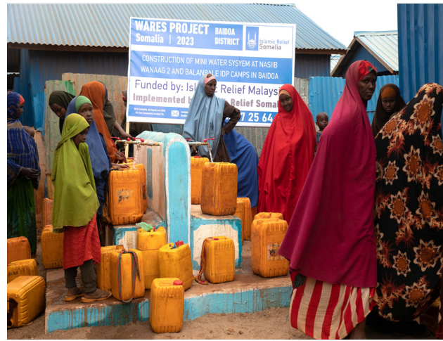
Communities collect water from a newly constructed water kiosk in Baidoa IDP camps, Somalia