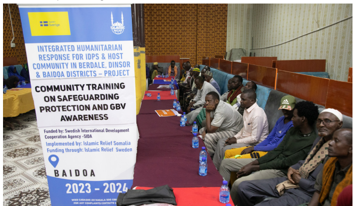
Community training on SGBV awareness in Baidoa, Somalia