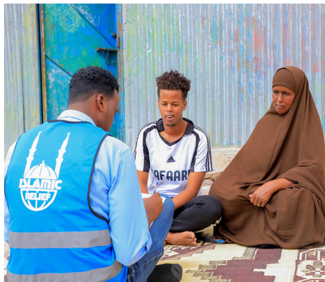
Orphan's home visit and assessment in Hargeisa, Somaliland.