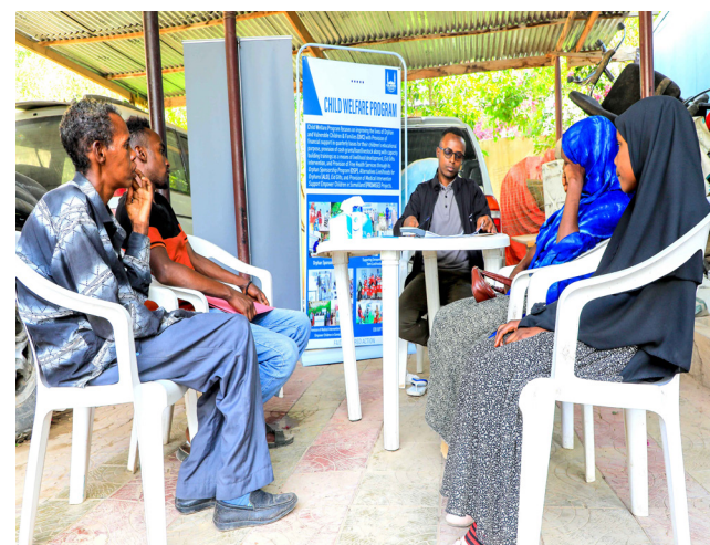
Registration of new orphan families in Hargeisa, Somaliland