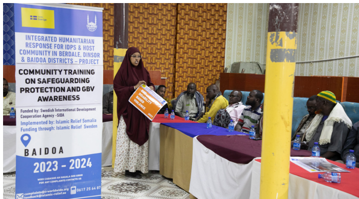
Community training on SGBV awareness in Baidoa, Somalia