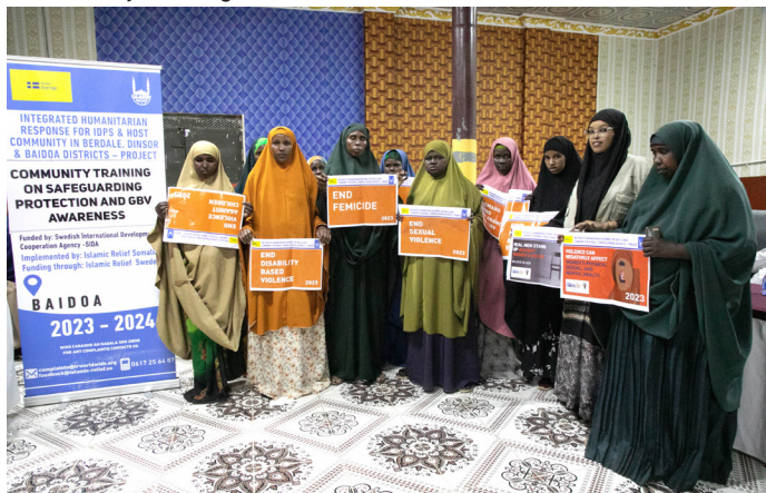
Community training on SGBV awareness in Baidoa, Somalia