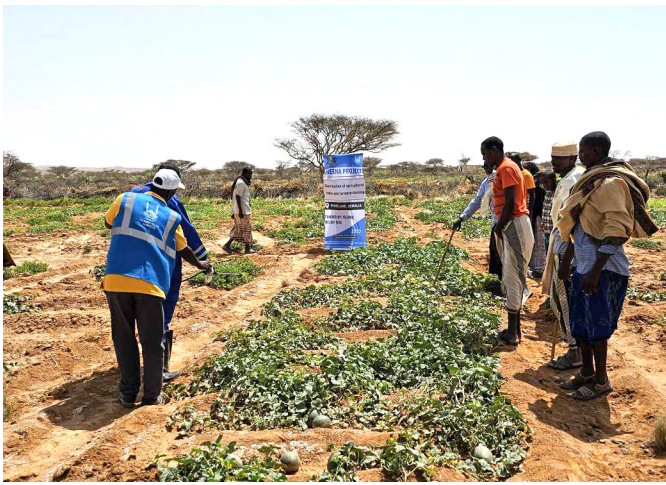
Good Agriculture Practice (GAP) training to 21 farmers in Puntland