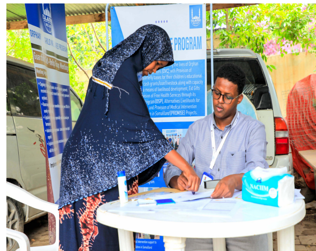
Registration of new orphan families in Hargeisa, Somaliland