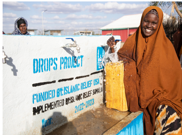
A woman from a camp in Baidoa fetches water from a newly constructed water kiosk in her camp in Baidoa, Somalia.