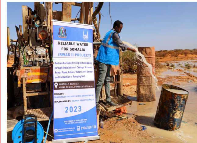
Drilling of a new borehole in Burtinle district of Puntland, Somalia