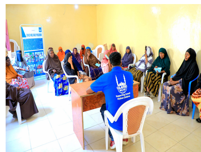
Orphan families Self Help Group meetings in Hargeisa, Somaliland