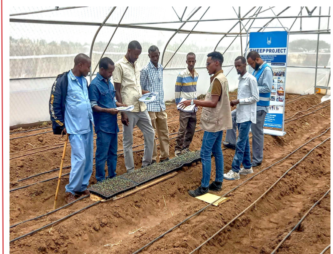
Construction of greenhouses with dimensions of 8X24 meter in Awdal region, Somaliland