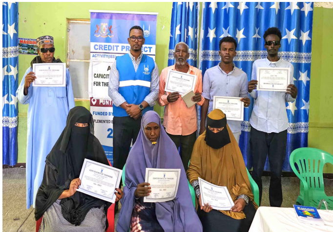
Water management committee training in Qardho, Puntland, Somalia