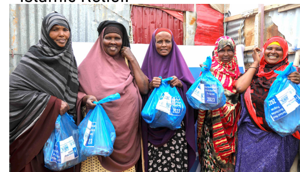
Distribution of Qurbani meat packs to the drought affected families in Garowe, Puntland, Somalia.