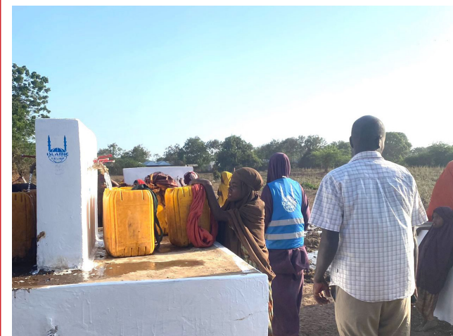
Drilling and equipping of a new borehole in Jowhar district, Middle Shabelle region, Somalia