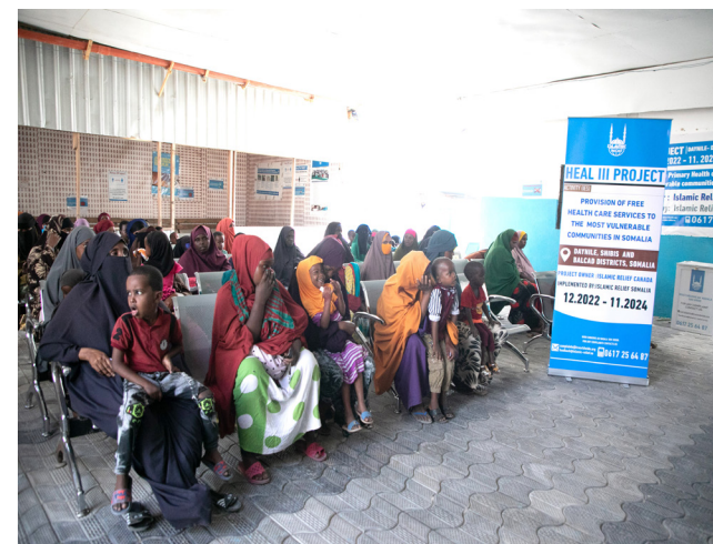
Provision of health support to the vulnerable patients in Mogadishu