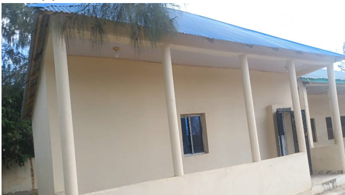
Construction of school laboratory for evergreen school in Balcad