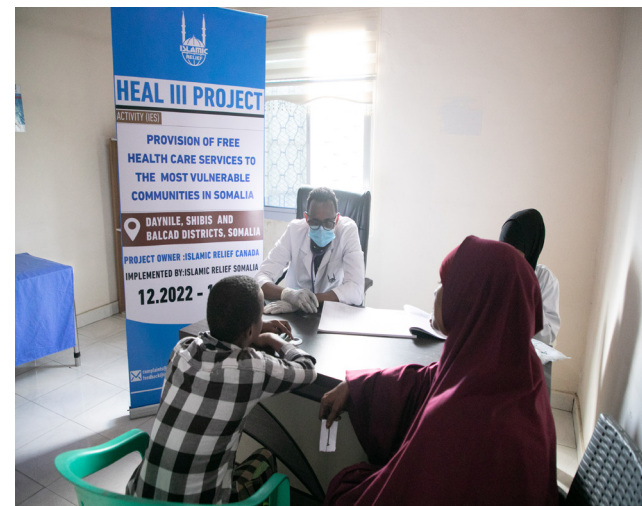
Provision of health support to the vulnerable patients in Mogadishu