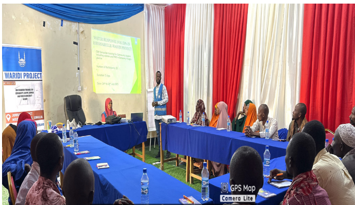
Training of 25 community leaders on GBV sensation in Jowhar