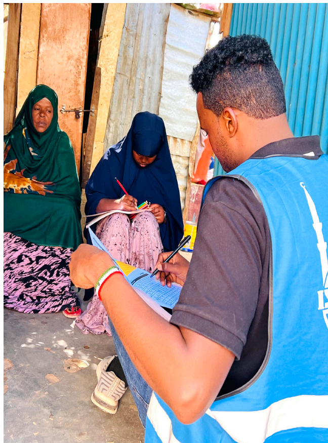
Orphan's home visit and assessment in Hargeisa, Somaliland.