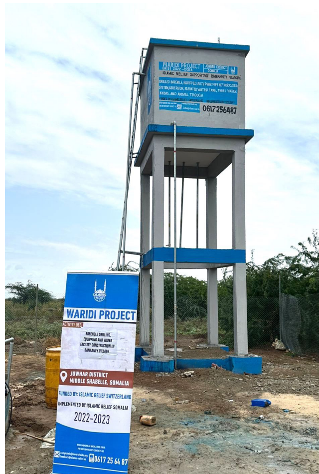
Drilling and equipping of a new borehole in Jowhar district, Middle Shabelle region, Somalia