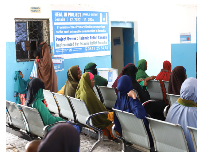
Provision of health support to the vulnerable patients in Mogadishu