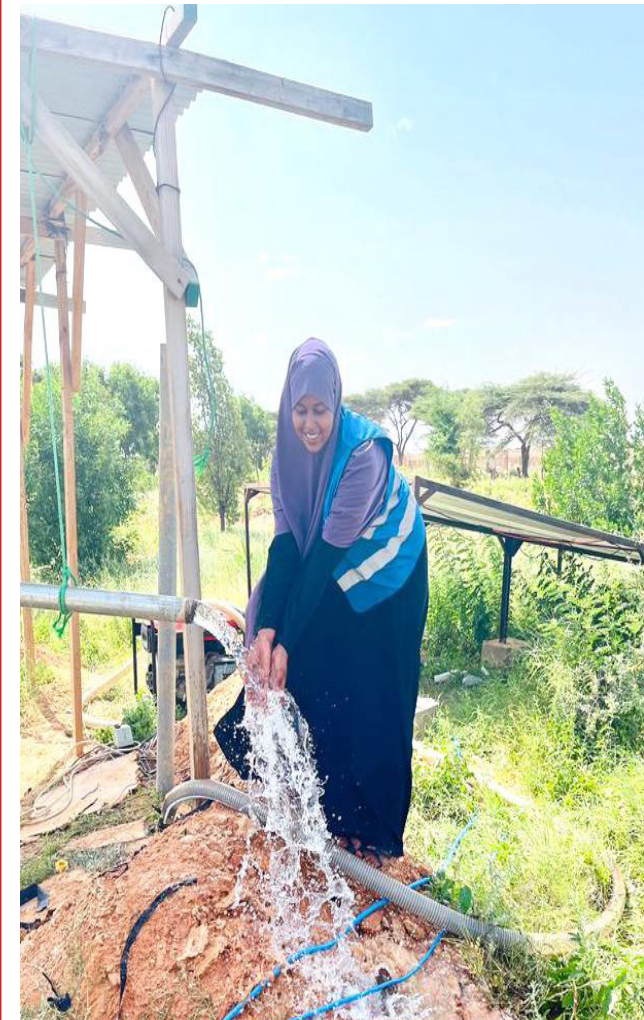
Rehabilitation of irrigation shallow well in Kubo village of Puntland