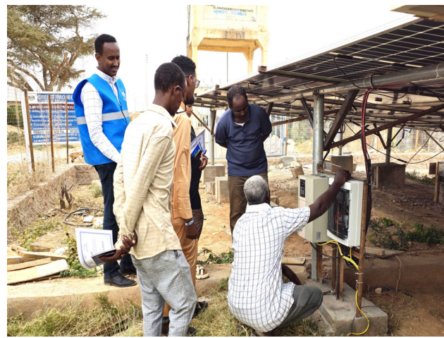
Practical session of water management committee training in Qardho, Puntland, Somalia