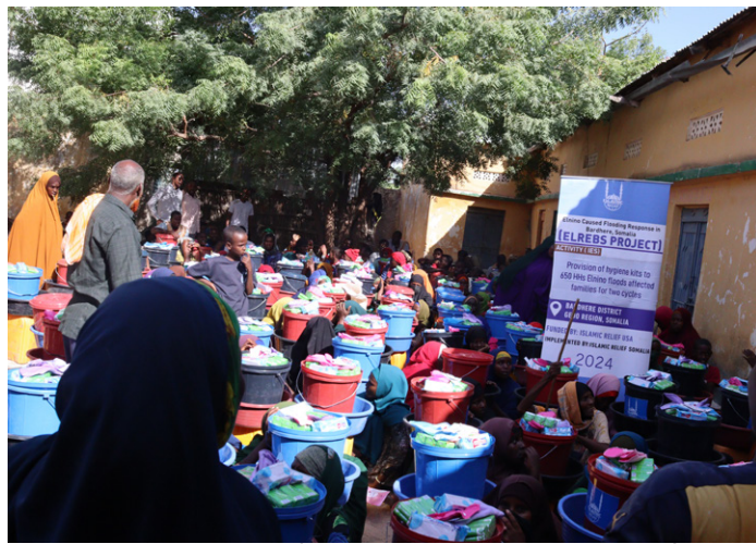
Provision of hygiene kits to 650 Elnino affected families in Bardhere, Somalia