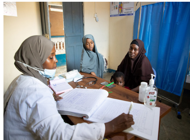
Providing health support to patients in need in Balcad, Somalia.