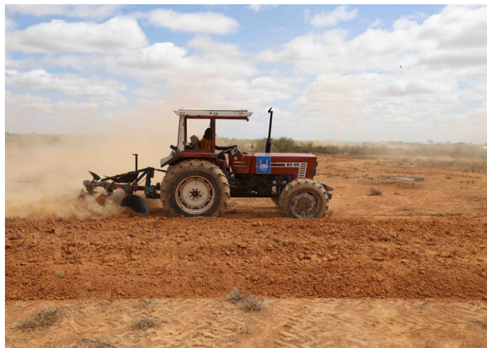
3 hours of land ploughing for Beledweye farmers in Hiraan region, Somalia