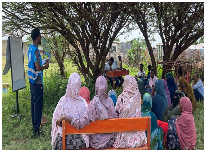
Training of 44 women for business management in Magala Cad, Somaliland