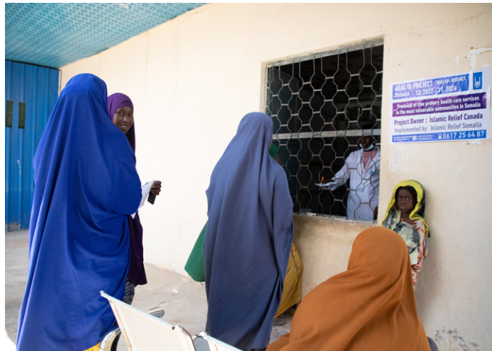
Providing health support to patients in need in Balcad, Somalia.