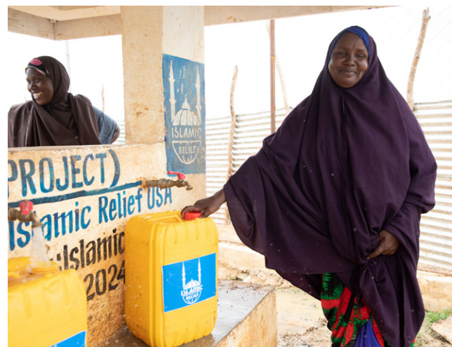
Providing clean and safe drinking water to the population in Bardhere camps.