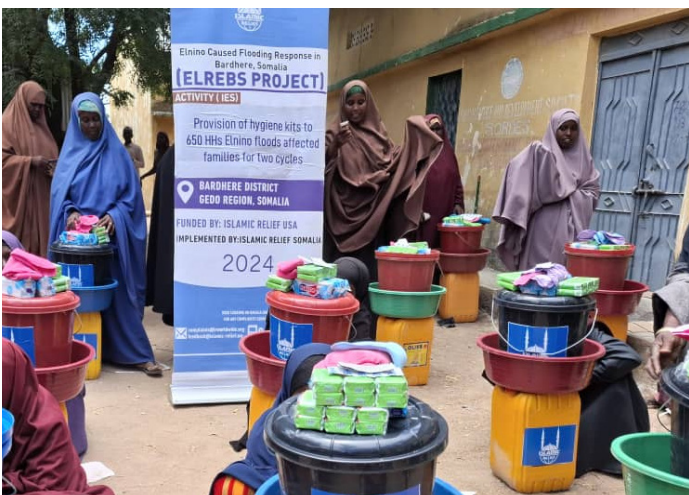
Provision of hygiene kits to 650 Elnino affected families in Bardhere, Somalia