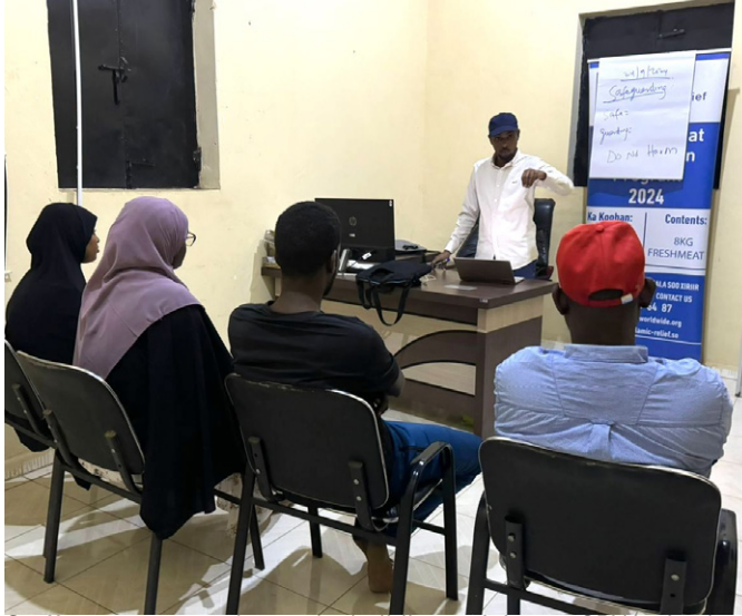
Staff awareness and capacity building training on GBV in Jowhar