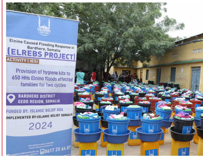
Provision of hygiene kits to 650 Elnino affected families in Bardhere, Somalia