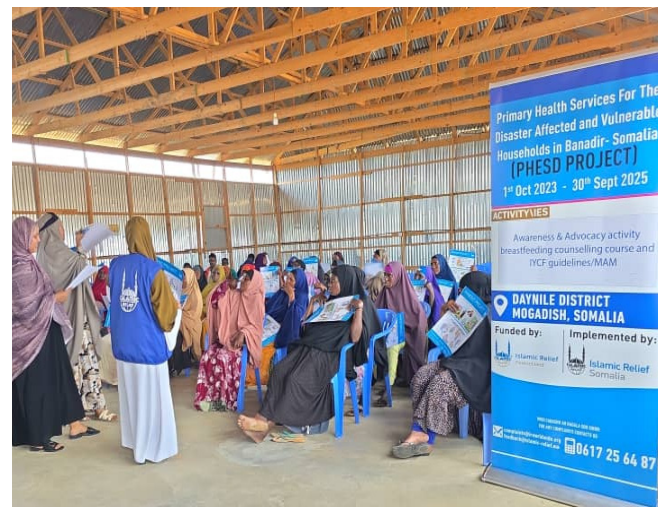
A course on infant and young child feeding (IYCF) for women.