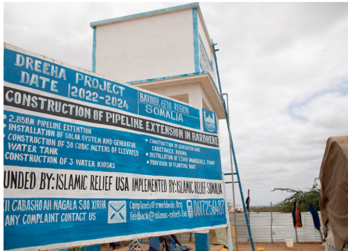
Providing clean and safe drinking water to the population in Bardhere camps.