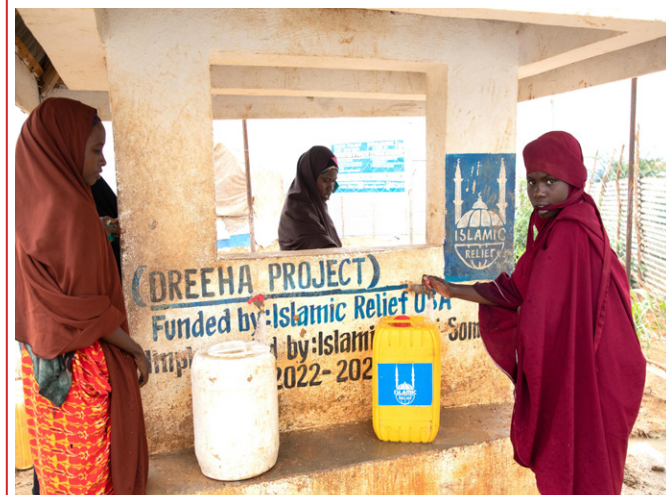
Providing clean and safe drinking water to the population in Bardhere camps.