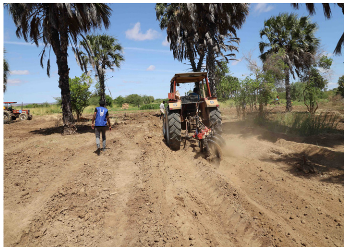
3 hours of land ploughing for Beledweye farmers in Hiraan region, Somalia