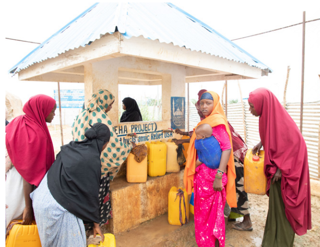
Providing clean and safe drinking water to the population in Bardhere camps.