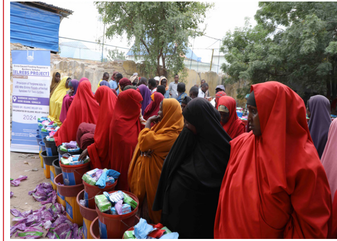
Provision of hygiene kits to 650 Elnino affected families in Bardhere, Somalia