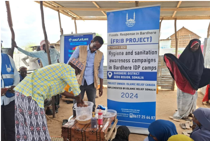
Hygiene & sanitation awareness campaign in Bardhere IDP Camps