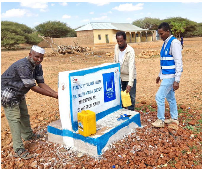
Rehabilitation of Jalam\Bandar borehole in Puntland, Somalia