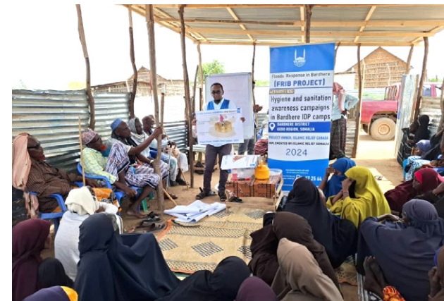
Hygiene & sanitation awareness campaign in Bardhere IDP Camps