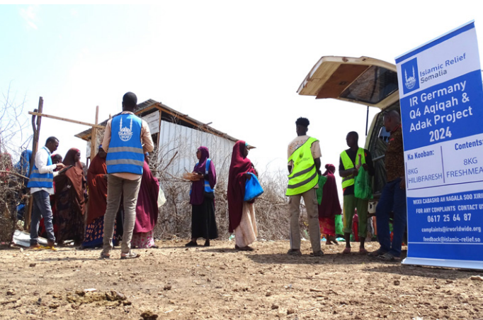
Aqiqah meat packs deliveries for those in need in Jowhar, middle shabelle