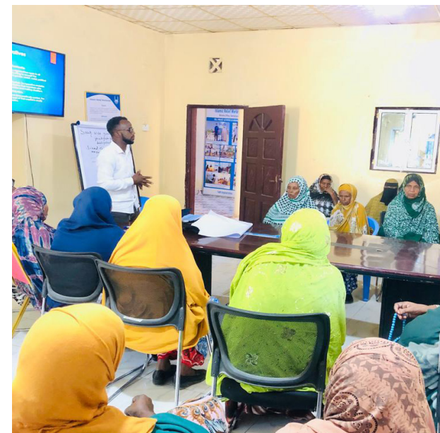
150 women milk sellers receive training on milk hygiene & cheese making