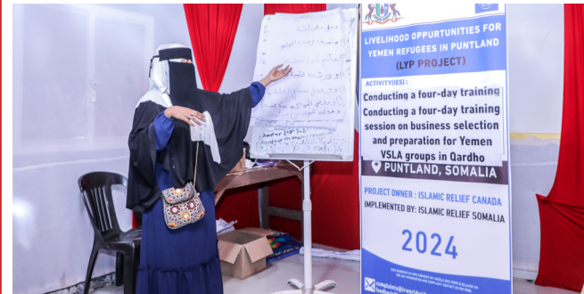
Training for 60 Members of VSLA Groups from Yemen Refugee Communities in Qardho, Puntland, Somalia