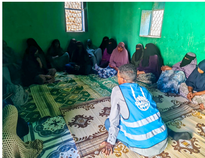
Verifying new orphan families in the Hargeisa district, Somaliland