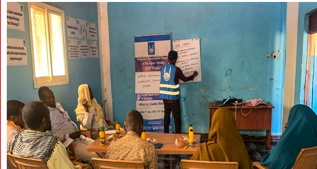
Water management committee training in Dinsoor District, Somalia