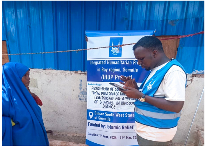
500 households in the Dinsoor district received unconditional cash transfers from Islamic Relief Somalia.