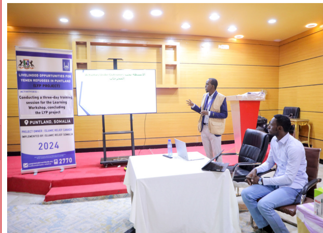
A three-day training session for the learning workshop, concluding LYP project in Qardho, Puntland, Somalia

Since my childhood, I used to have an amazing fondness for supporting those in need. My mother used to say, "Help the people, and Allah will help you achieve your dreams smoothly". I have been in this noble work for the past 8 years with different organizations. Thus, my passion is seeing my people break the cycle of poverty through our support and humanitarian interventions.