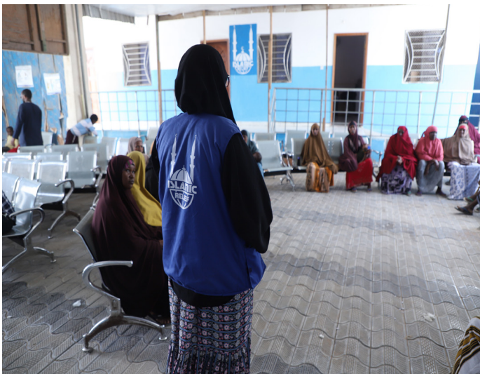
Islamic Relief Protection team provides counselling support services in Daynile district, Somalia