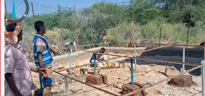
Shallow well construction in Bardale, Somalia