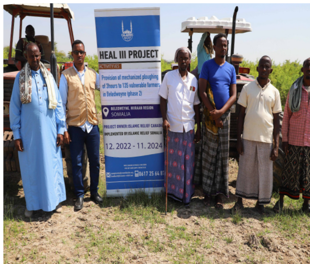
Land ploughing for 135 farmers in Qoydo and Harcadey villages in Beledwayne district, Somalia