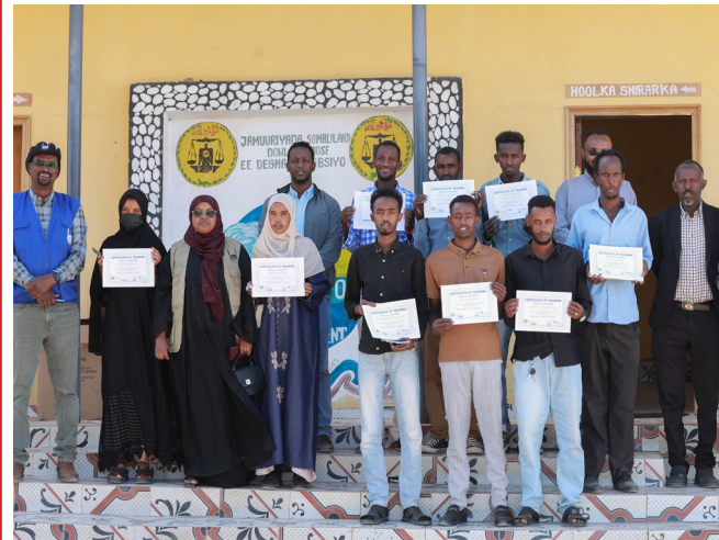
Distribution of animal medical kits in Arabsiyo, Boodhlay, and Beenyo-Qalocan villages, Somaliland