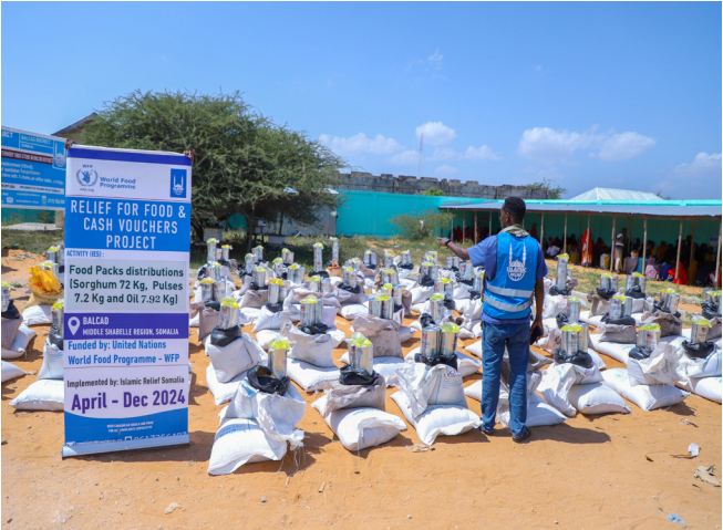
Distribution of in-kind food relief in Adale and Raga-Celle district, Somalia