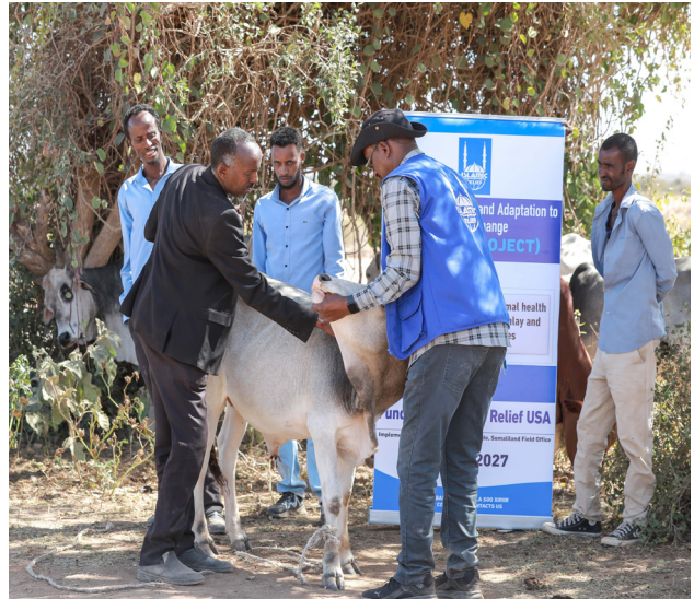
Distribution of animal medical kits in Arabsiyo, Boodhlay, and Beenyo-Qalocan villages, Somaliland