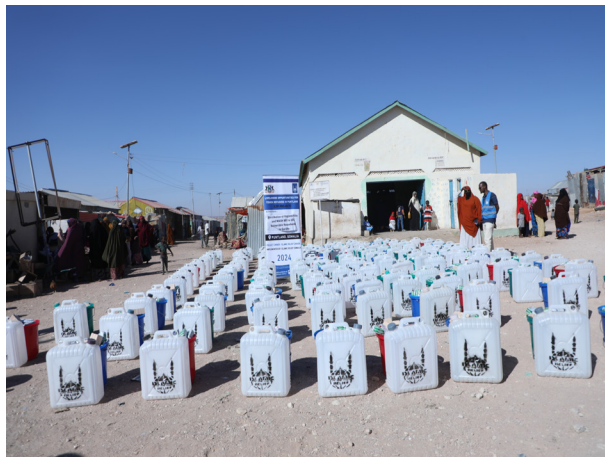
Distribution to hygiene kits and NFI to 600 households in Qardho, Puntland, Somalia