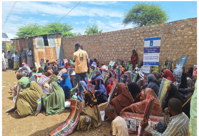
Islamic Relief distributed family sleeping mats to 250 households in Berdale District, Somalia