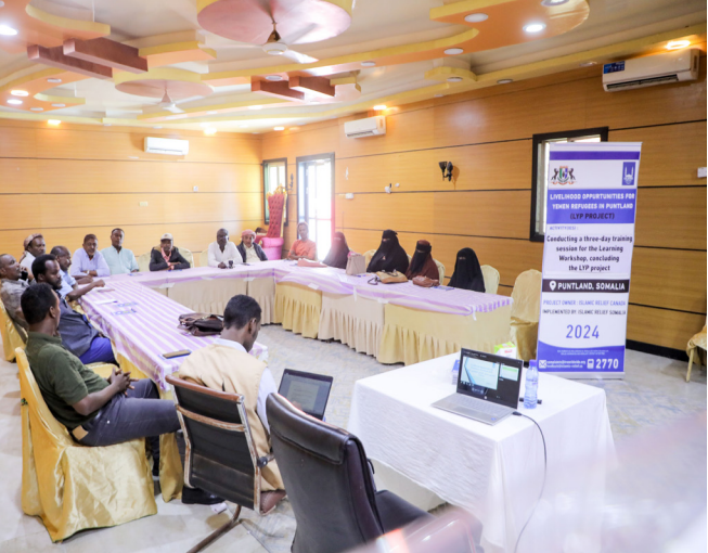
A three-day training session for the learning workshop, concluding LYP project in Qardho, Puntland, Somalia