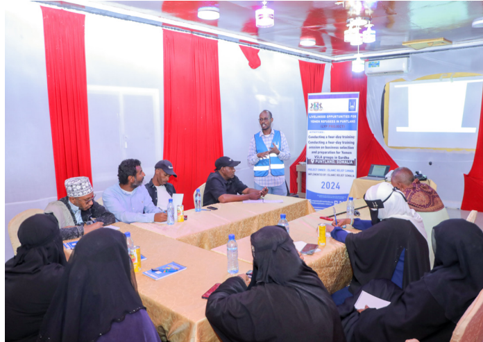
Training for 60 Members of VSLA Groups from Yemen Refugee Communities in Qardho, Puntland, Somalia