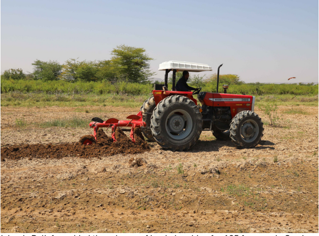
Islamic Relief provided three hours of land ploughing for 135 farmers in Qoydo and Harcadey villages in Beledwayne district, Somalia