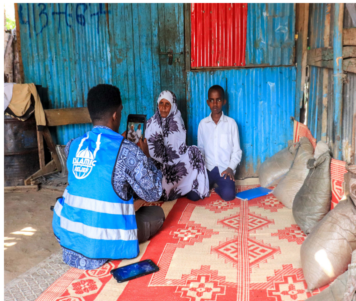
Verifying new orphan families in the Hargeisa district, Somaliland