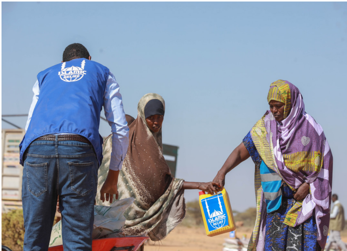
450 households in Oog IDP camp, Somaliland, received food assistance.