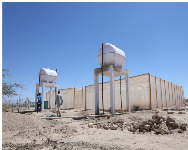
Construction and installation of three greenhouses in Xubeera and Dhanha villages, Puntland, Somalia