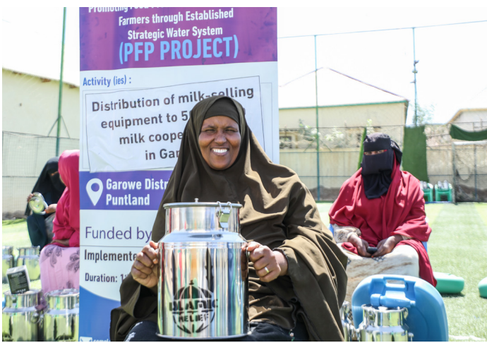
Fifty women milk vendors in Garowe, Puntland, Somalia, received milk equipment