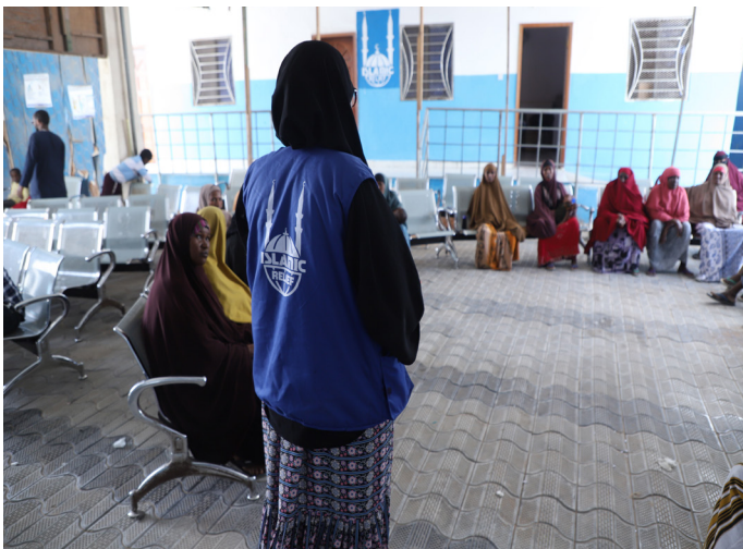
Islamic Relief's protection team has launched counseling support services in Daynile district of Somalia