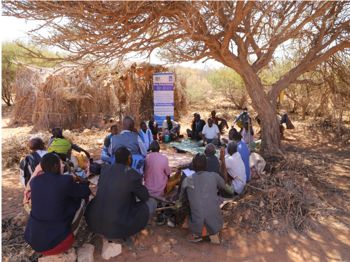
Community mobilization in Nugal, Sool and karkar Regions, Puntland, Somalia