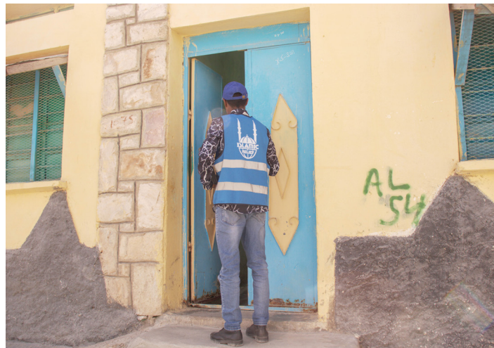
Orphan home visit assessment in Hargeisa, Somaliland