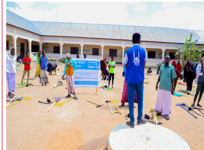
Distribution of seeds and tools in Kurshale, Celgelle and Bulo-jay, Somalia