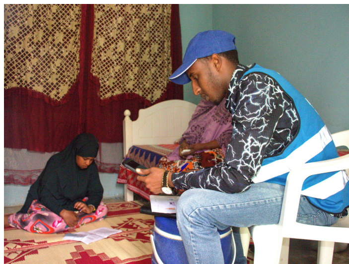
Orphan home visit assessment in Hargeisa, Somaliland