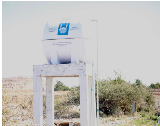
Rehabilitation of six shallow wells for irrigation in Laacdhere and Jibaxo, Puntland, Somalia