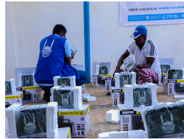
Distribution of solar powered torches to 150 women in Balcad district, Somalia