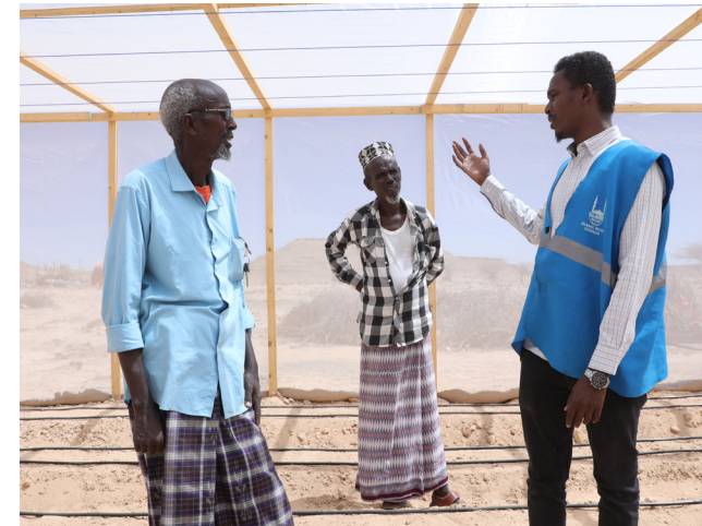
Construction and installation of three greenhouses in Puntland, Somalia (Xubeera and Dhanha villages)