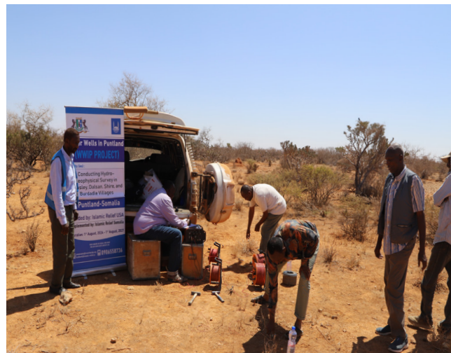
Geophysical Survey conducted in the Nugal, Sool, and Karkar Regions of Puntland, Somalia