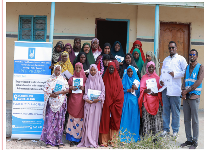
Training of milk cooperatives in Dheenta and Dhubato villages, Somaliland