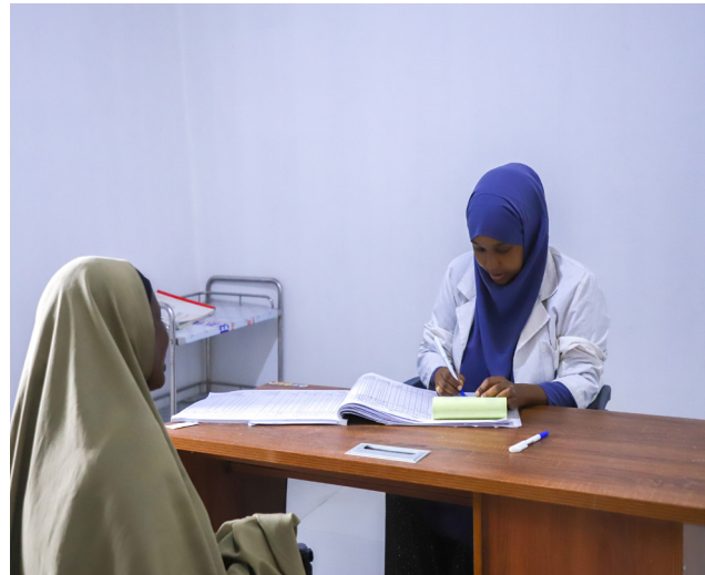
Provision of health support to the vulnerable patients in Mogadishu