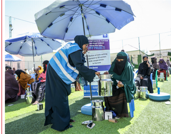
Fifty women milk vendors in Garowe, Puntland, Somalia, received milk equipment