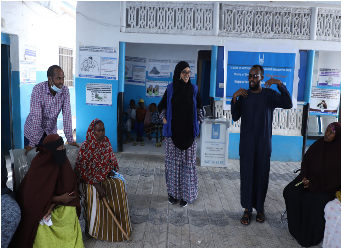
Islamic Relief's protection team has launched counseling support services in Daynile district of Somalia