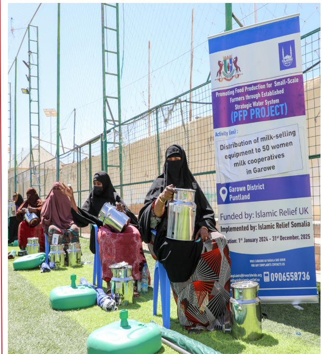
Fifty women milk vendors in Garowe, Puntland, Somalia, received milk equipment