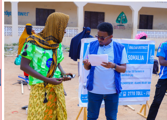
Distribution of seeds and tools in Kurshale, Celgelle and Bulo-jay farmers Somalia

The LIWASES project has reached 5,000 households, impacting 29,840 people. Mukhtar’s story exemplifies the power of targeted interventions to alleviate poverty and build resilience in Somalia. Islamic Relief’s work demonstrates the profound impact of sustained support for vulnerable communities.