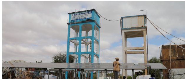
Enhancing water infrastructure in Hawl-wadaag village, Baladweyne, Somalia