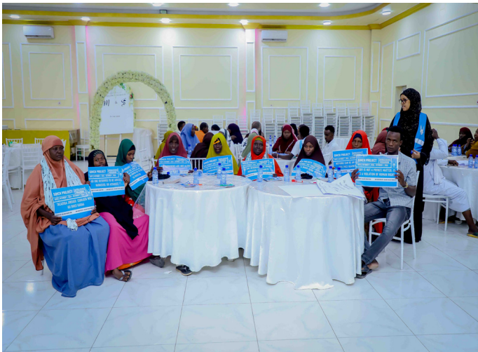
Islamic Relief Protection team provides training on GBV and SGBV in Daynile district, Somalia