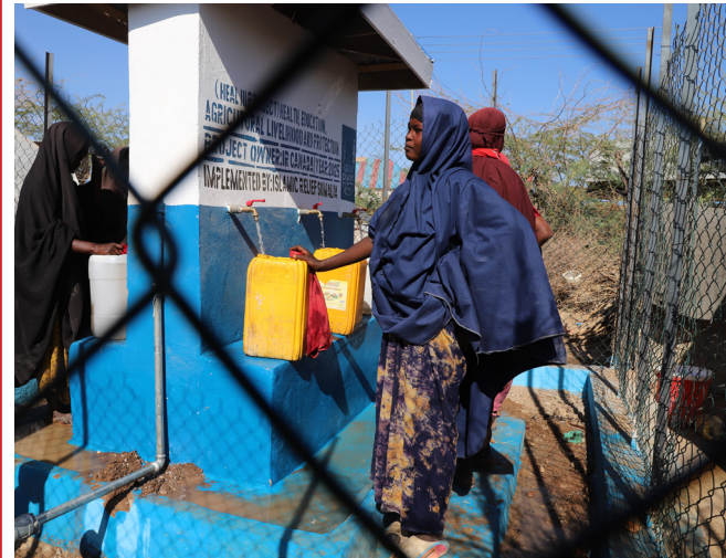
Construction of six new water kiosks in Hawl-Wadag village, Beledweyne, Somalia