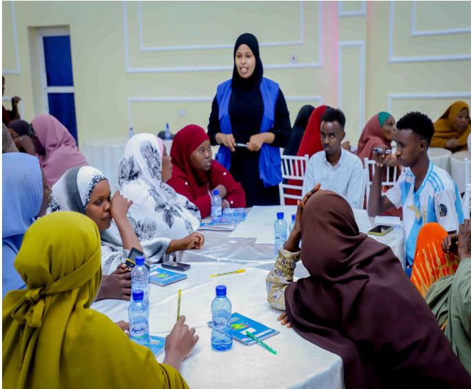
Islamic Relief Protection team provides training on GBV and SGBV in Daynile district, Somalia