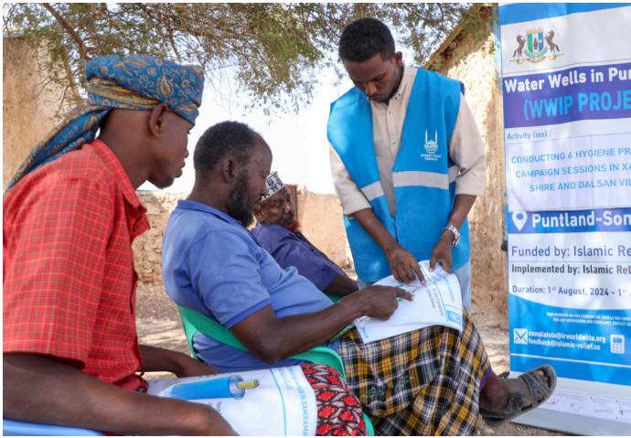
Hygiene promotion campaign in Dalsan, Xamxamaa and Shire villages in Puntland, Somalia.