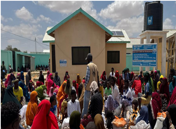
Provision of in-kind food assistant to households in Balcad district, Somalia.