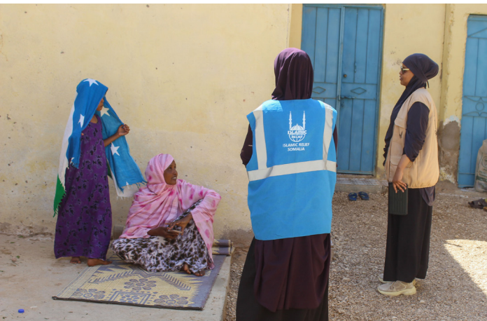
Orphan home visit assessment in Garowe, Puntland, Somalia