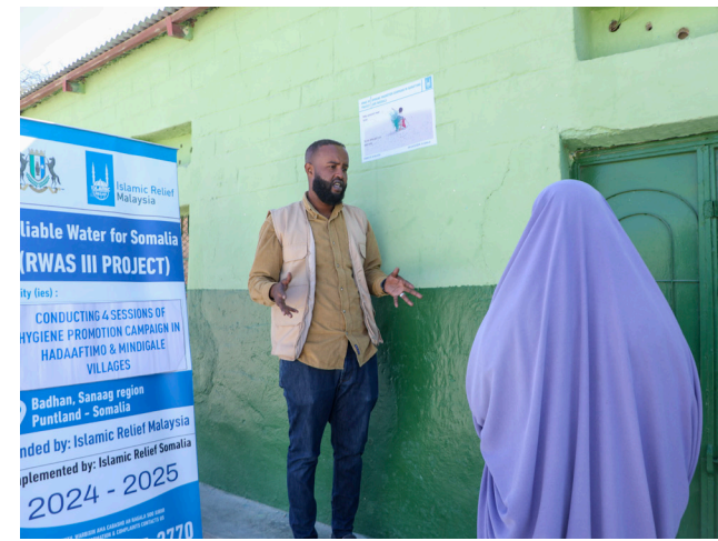
Hygiene promotion campaign in Hadaftimo and Midigale villages in Puntland, Somalia