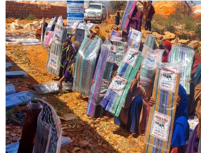
Distribution of family sleeping mats to 500 households in Baidao IDP camps, Somalia