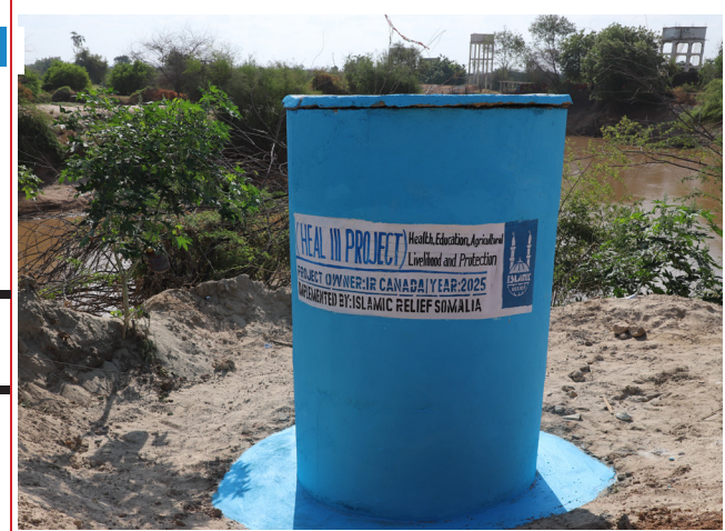
Rehabilitation of water tank in Hawl-Wadag village, Beledweyne, Somalia.