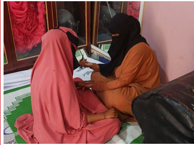
Islamic Relief implementing internship programme for TVET in Borama, Somaliland.