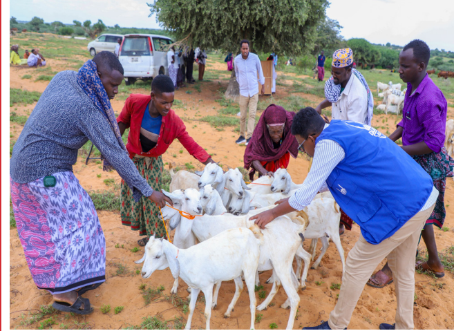
Livestock restocking for 100 households in Balcad district, Somalia