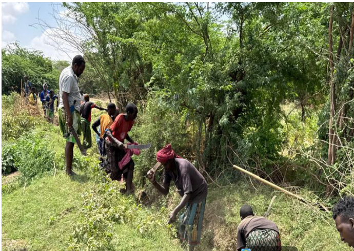
Provision of three hours land ploughing for 135 farmers in Qoydo and Harcadey villages, Somalia.