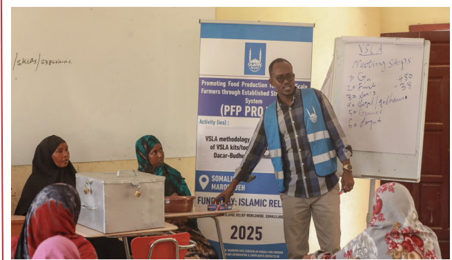
Training of VSLA groups in Somaliland